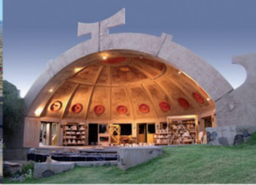
Paolo Soleri's Arcosanti at Cordes Junction