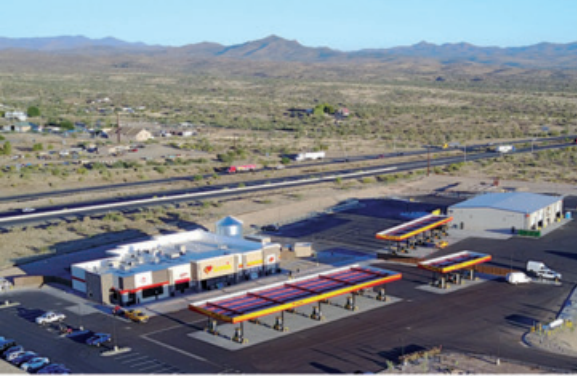
New Loves Truck Stop North of the Subject