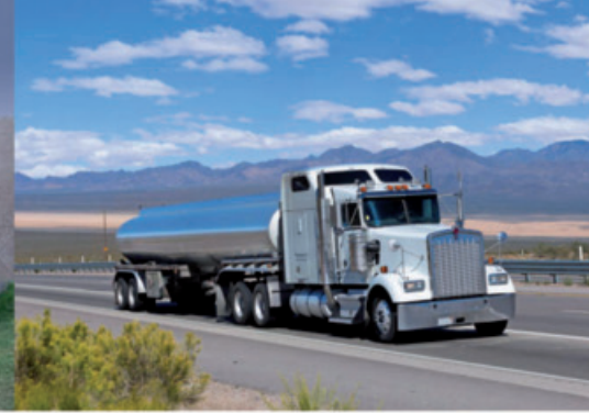
Heavy Truck Traffic on Interstate 17