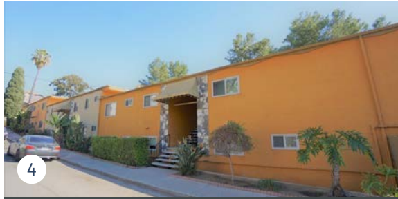
3737 Keating Street, San Diego CA 92110