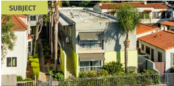
SUBJECT 3533 6th Avenue, San Diego CA 92103