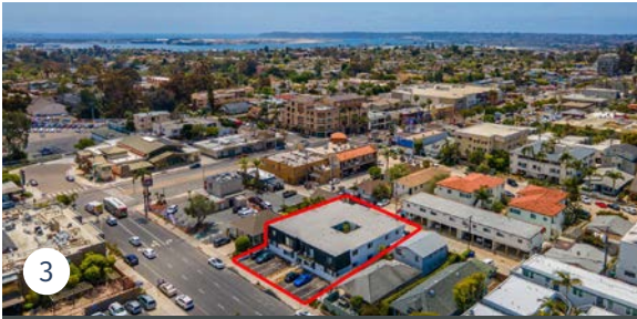
4030 Front Street, San Diego, CA 92103