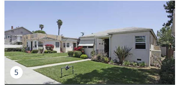
4641-4655 North Avenue, San Diego CA 92116