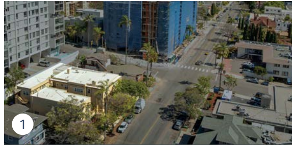
1 2621 First Avenue, San Diego CA 92103