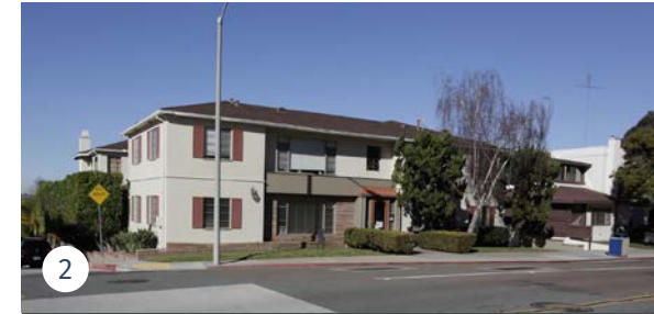
2 2920 1st Avenue, San Diego CA 92103