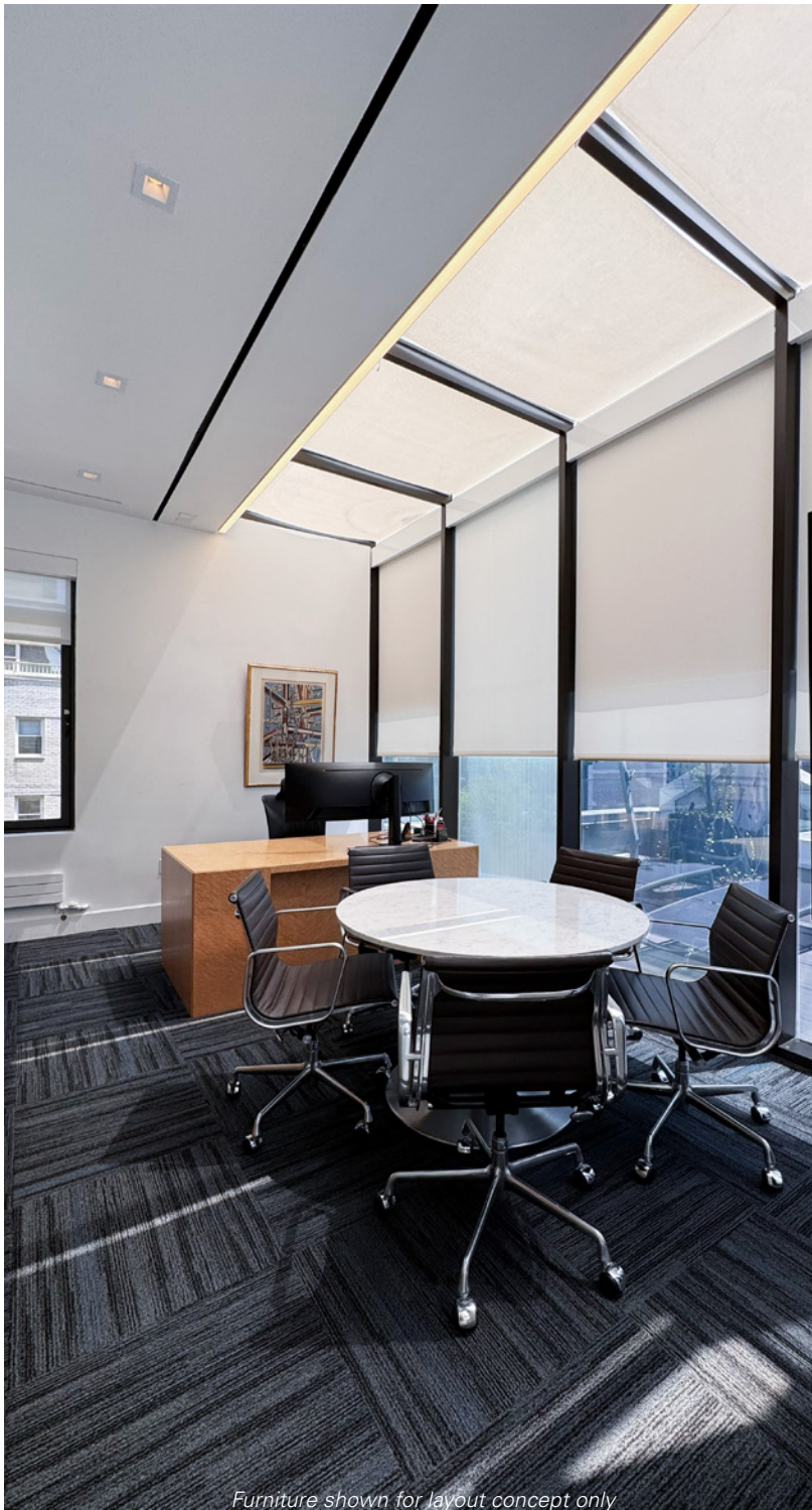
Furniture shown for layout concept only