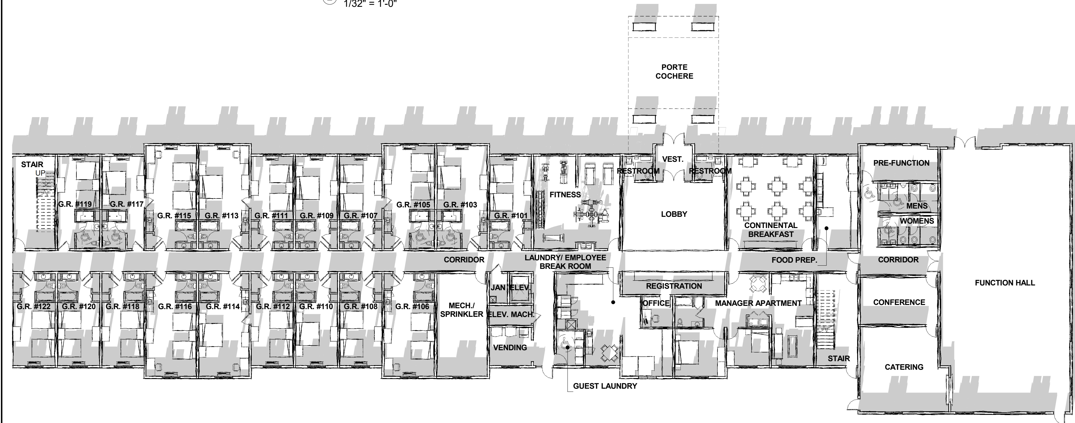
① OPTION 4 - SCHEMATIC FIRST FLOOR PLAN - TWO STORY 1/16" = 1'-0"