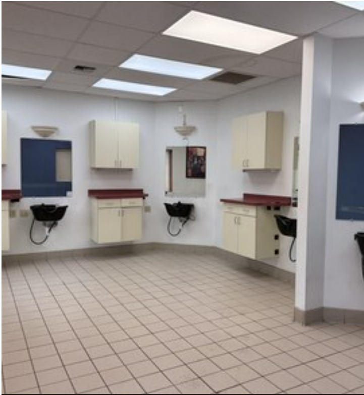
Main salon floor -- 4 styling stations