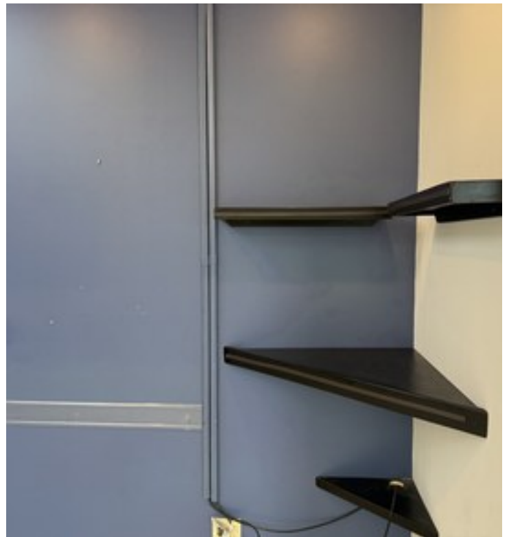
Retail display shelving