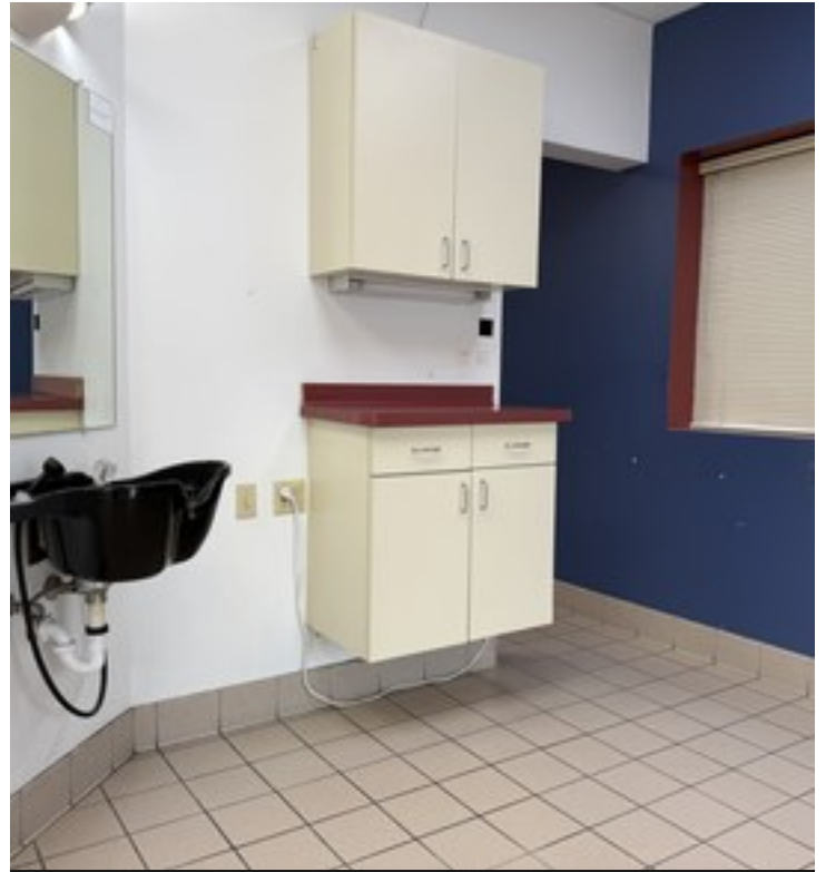
Individual station with shampoo bowl