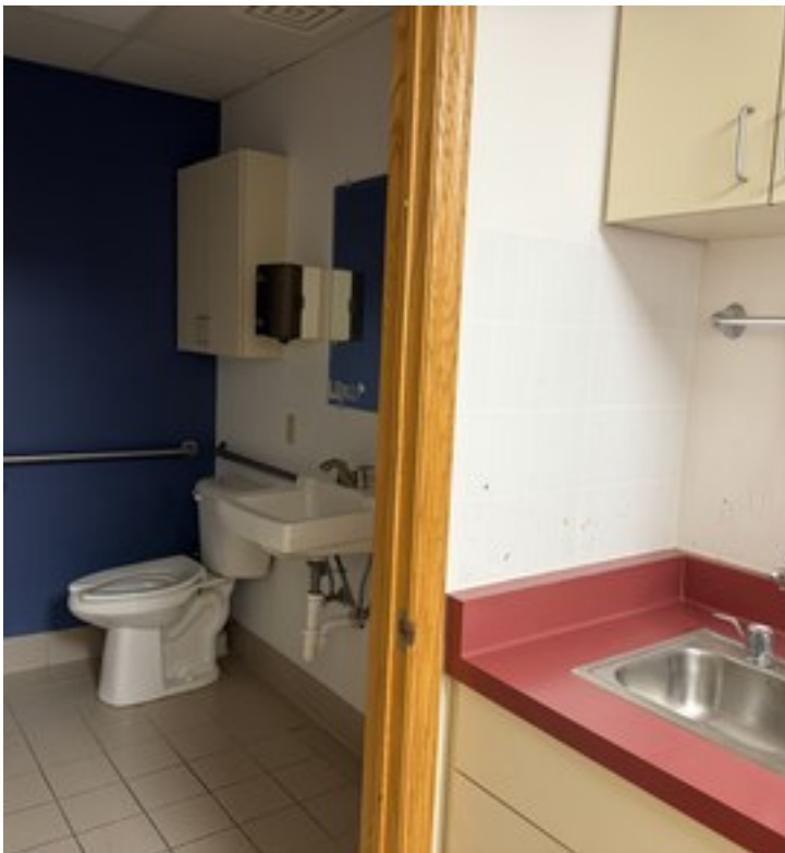
Restroom & kitchenette area