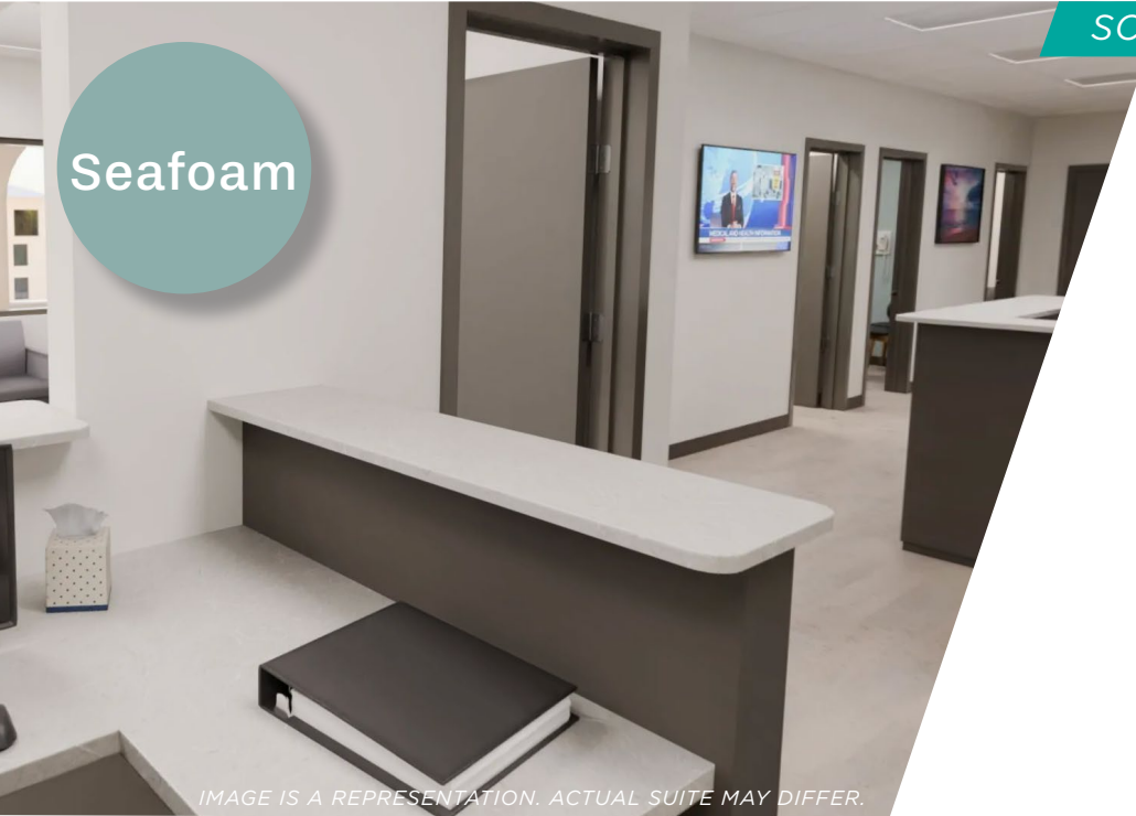
IMAGE IS A REPRESENTATION. ACTUAL SUITE MAY DIFFER.