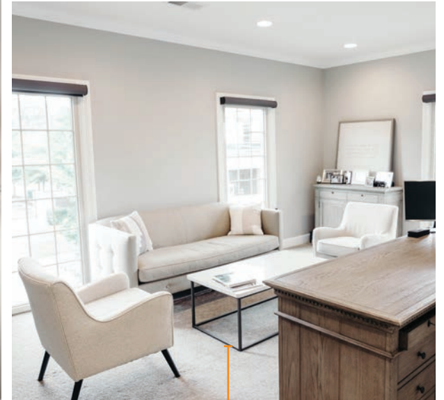
OFFICES + MEETING SPACE