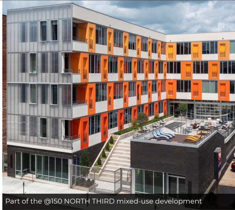
Part of the @150 NORTH THIRD mixed-use development