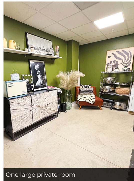
One large private room