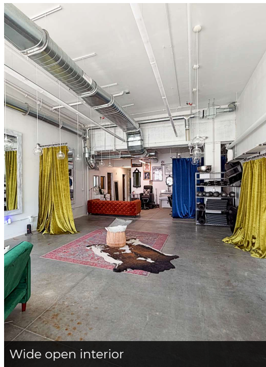
Wide open interior