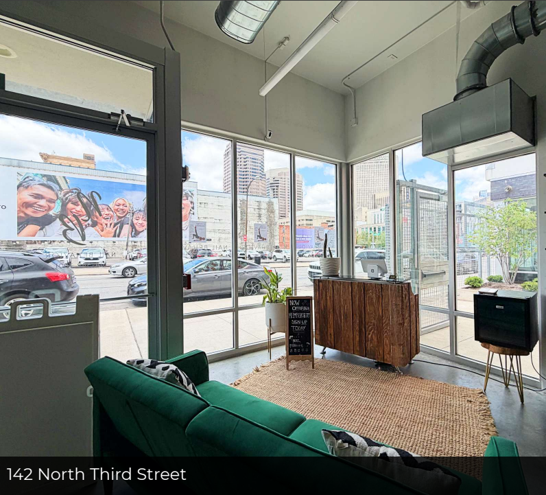
142 North Third Street

150 NORTH THIRD STREET, COLUMBUS, OH 43215