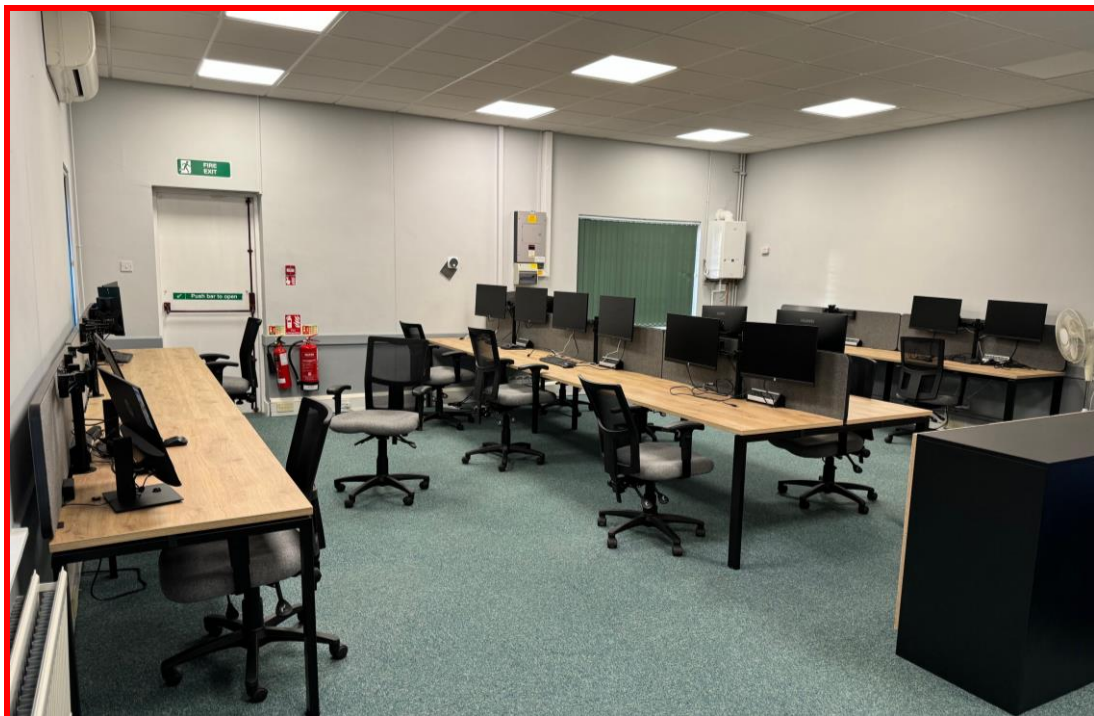
Internal view of the Ground Floor, Unit 2