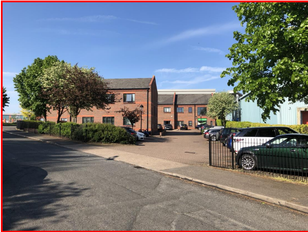
View of the units at Hill Court from Turnpike Close