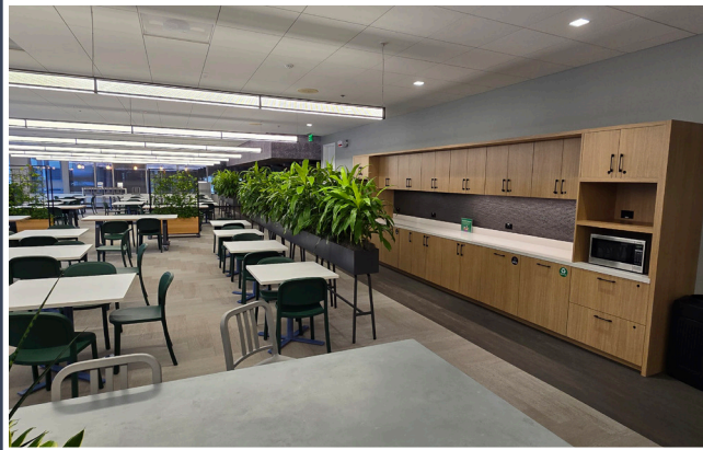
building break area