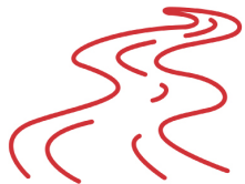
Scenic River Views