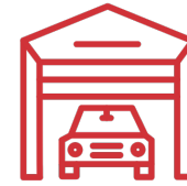
7 Underground Parking Spots