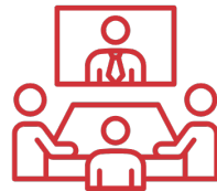
3 Conference Rooms