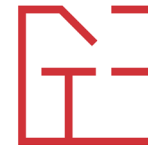
Flexible Floor Plan/Subdivisible

ADDRESS 200 E. 10th St, 4th Floor, Sioux Falls, SD 57104