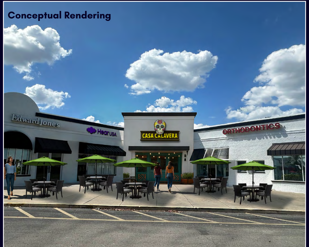
Unit 103 & 105