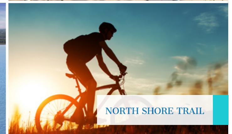
NORTH SHORE TRAIL