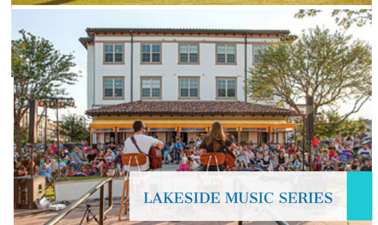
LAKESIDE MUSIC SERIES