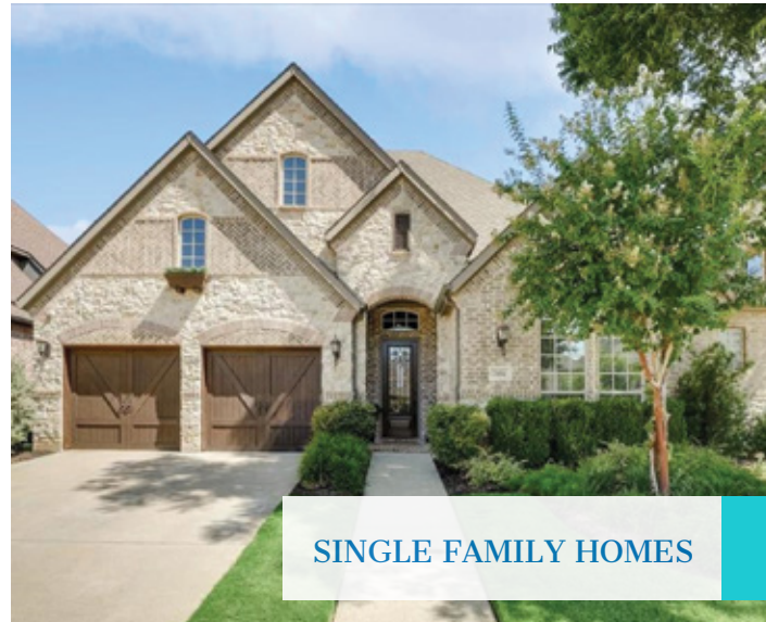
SINGLE FAMILY HOMES