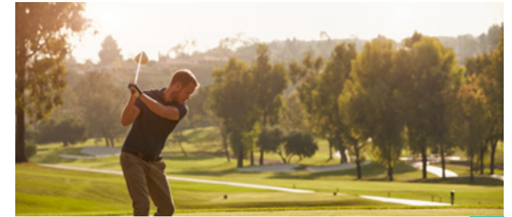
COWBOYS CHAMPIONSHIP GOLF COURSE