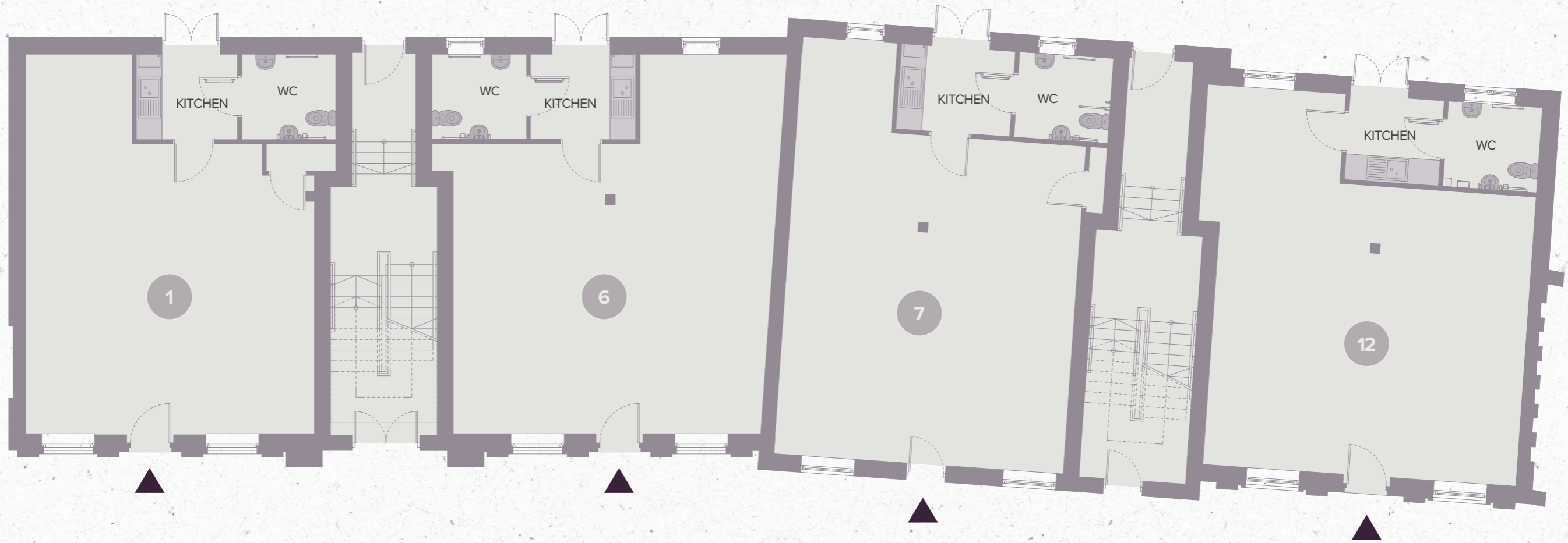
1 WINCOTT SQUARE 62.9 sq m / 677 sq ft