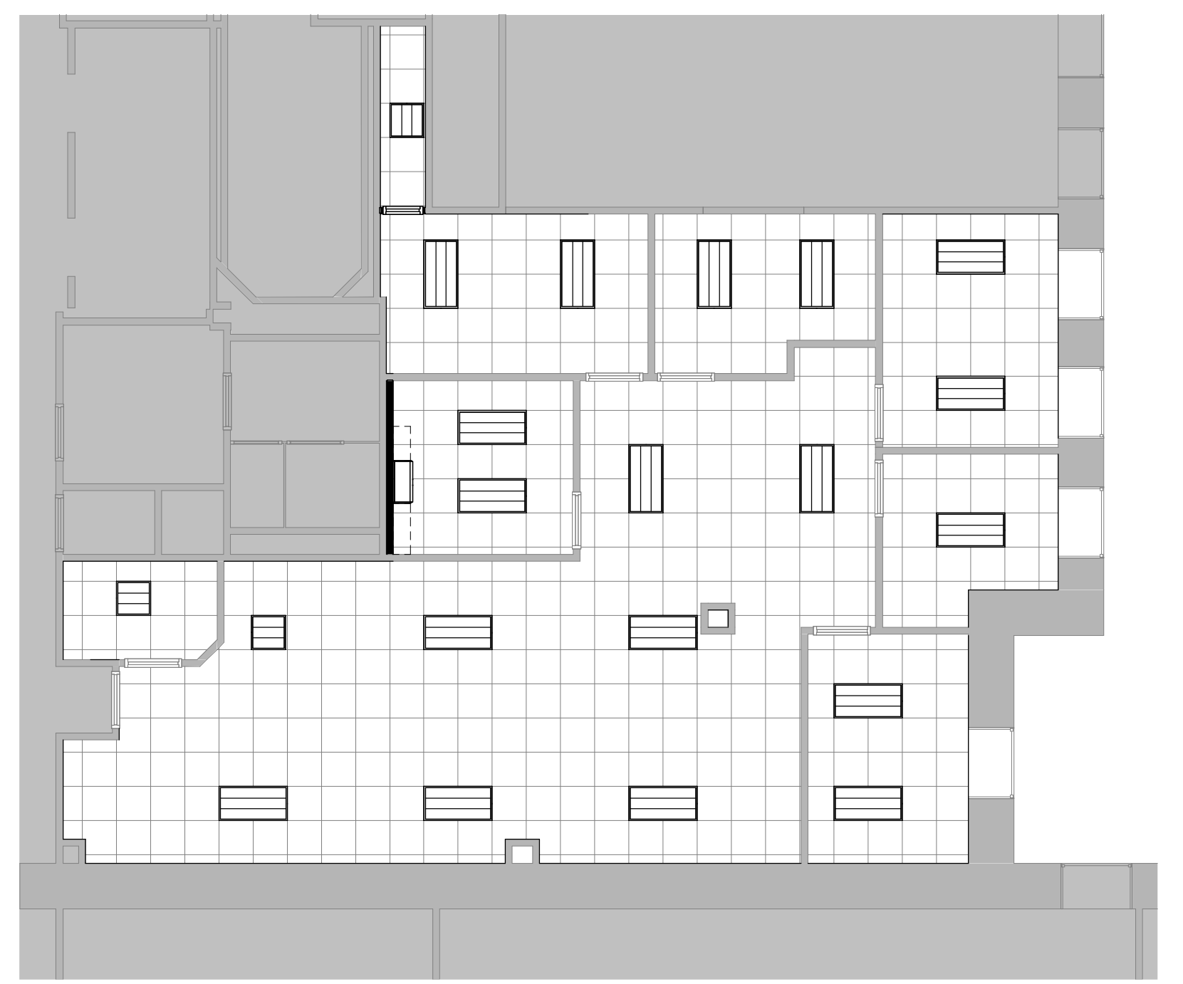
3 SUITE 105 - REFLECTIVE CEILING PLAN 1/8" = 1'-0"