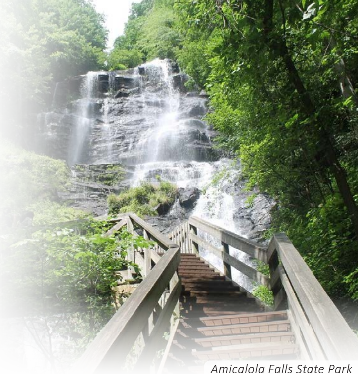
Amicalola Falls State Park

Dawsonville continues to put out the “welcome mat” for locals and tourists and hosts a number of festivals and events, including The Mountain Moonshine Festival the 4th weekend in October. The Dawsonville town square comes alive with plays, clogging, and other entertainment.