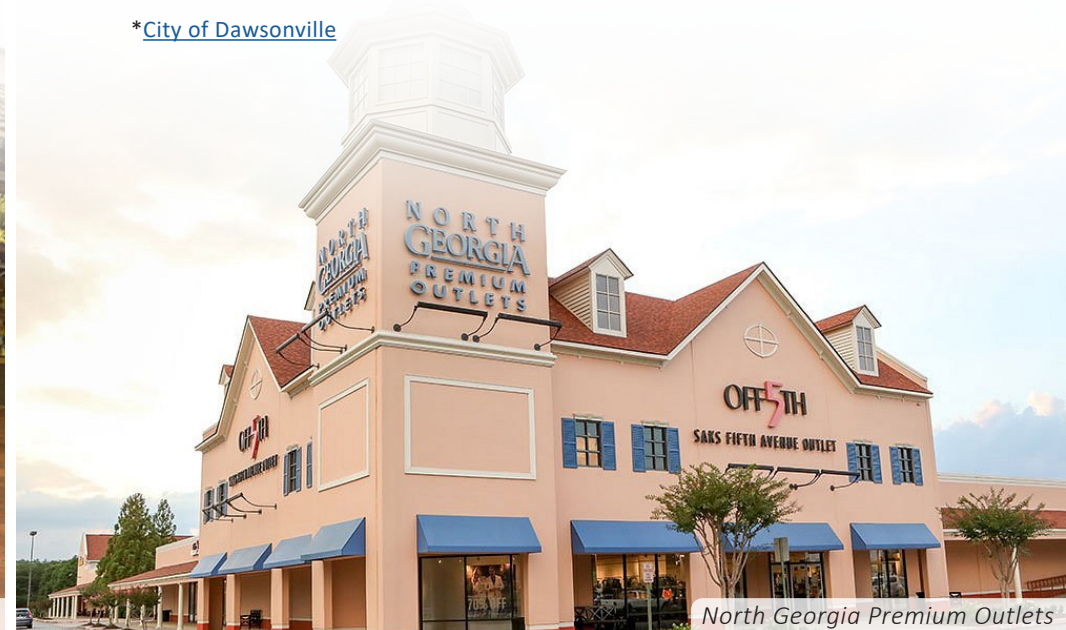
North Georgia Premium Outlets