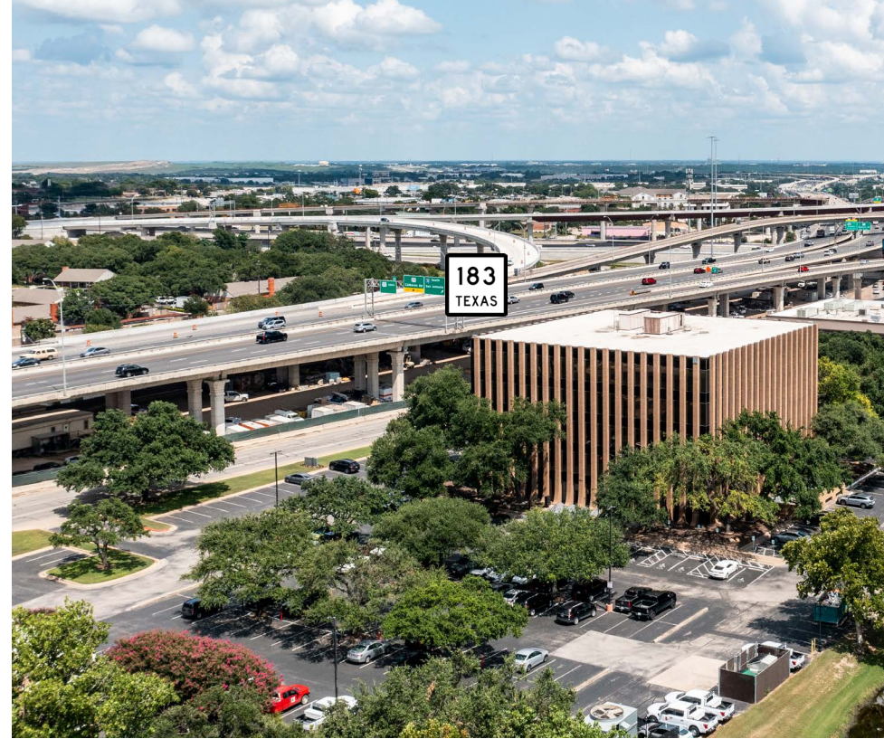
▲ Located at the corner of Hwy 183 & IH-35