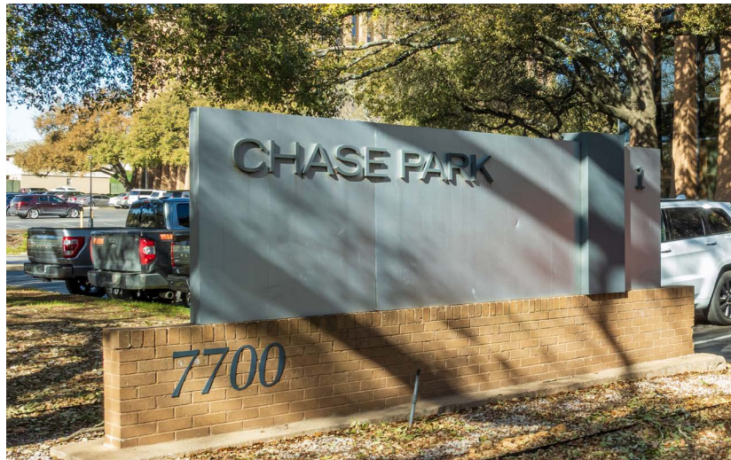
▲ Monument Signage Available