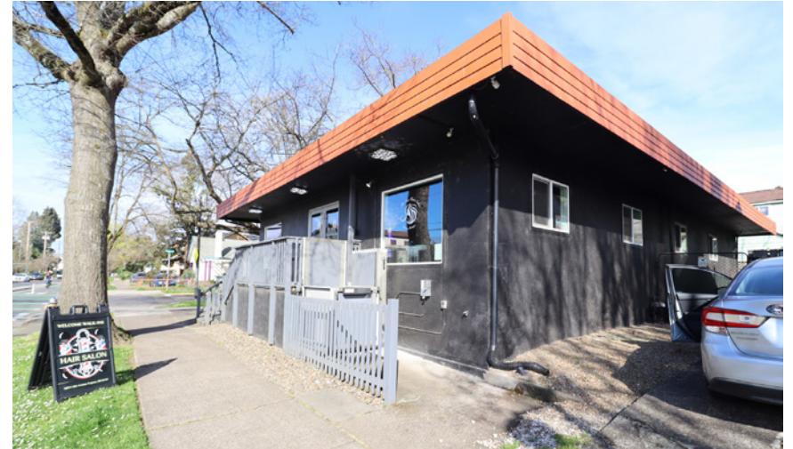
ADA ENTRY WITH LIFT ACCESS INSTALLED