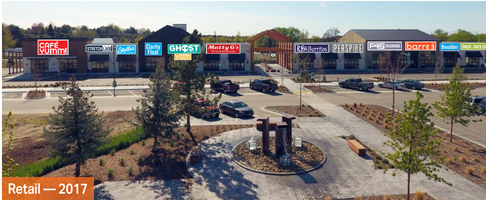
Retail — 2017