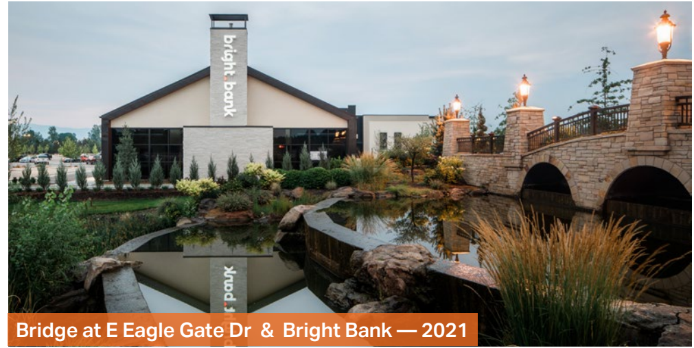
Bridge at E Eagle Gate Dr & Bright Bank — 2021