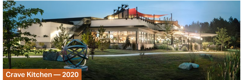
Crave Kitchen — 2020