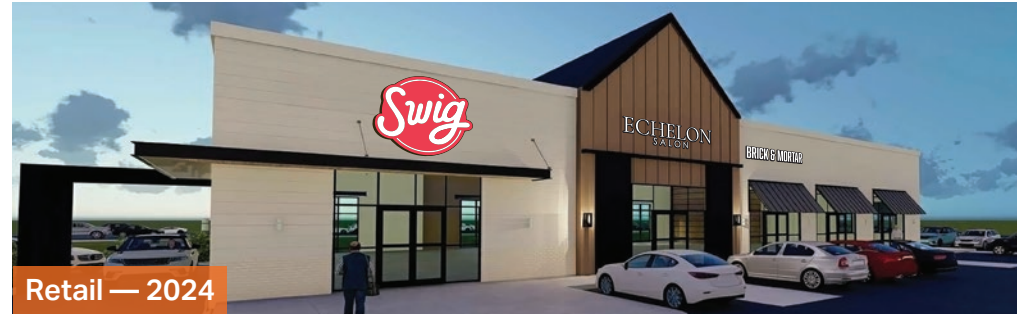
Retail — 2024