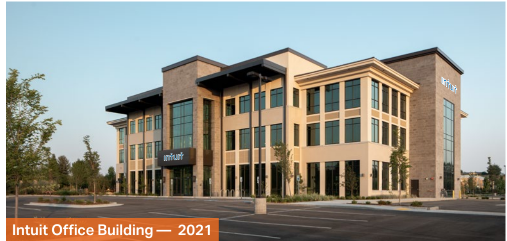
Intuit Office Building — 2021