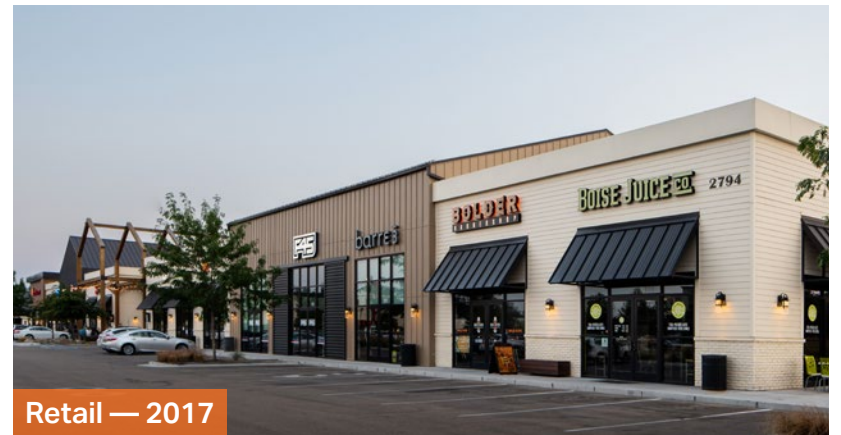
Retail — 2017