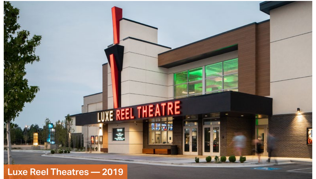
Luxe Reel Theatres — 2019