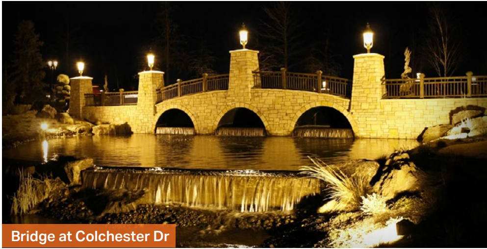
Bridge at Colchester Dr