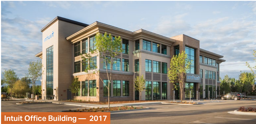
Intuit Office Building — 2017