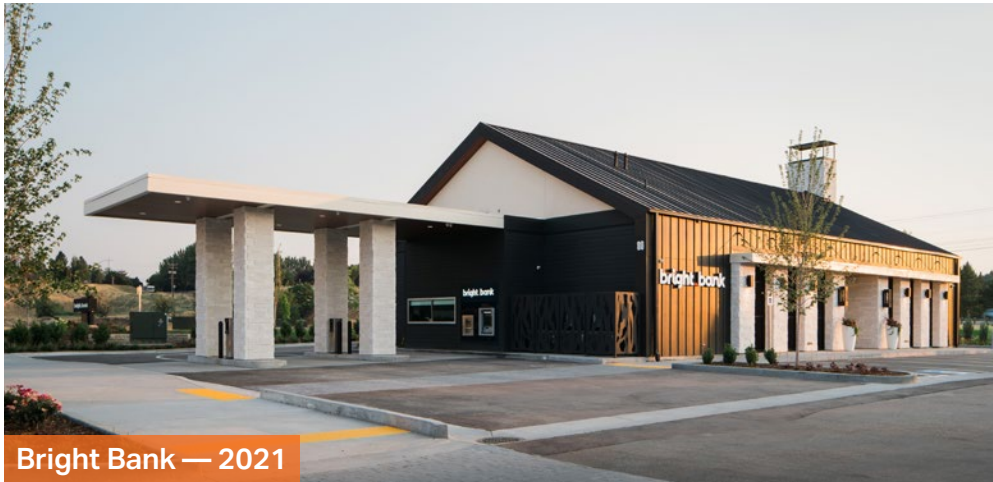
Bright Bank — 2021