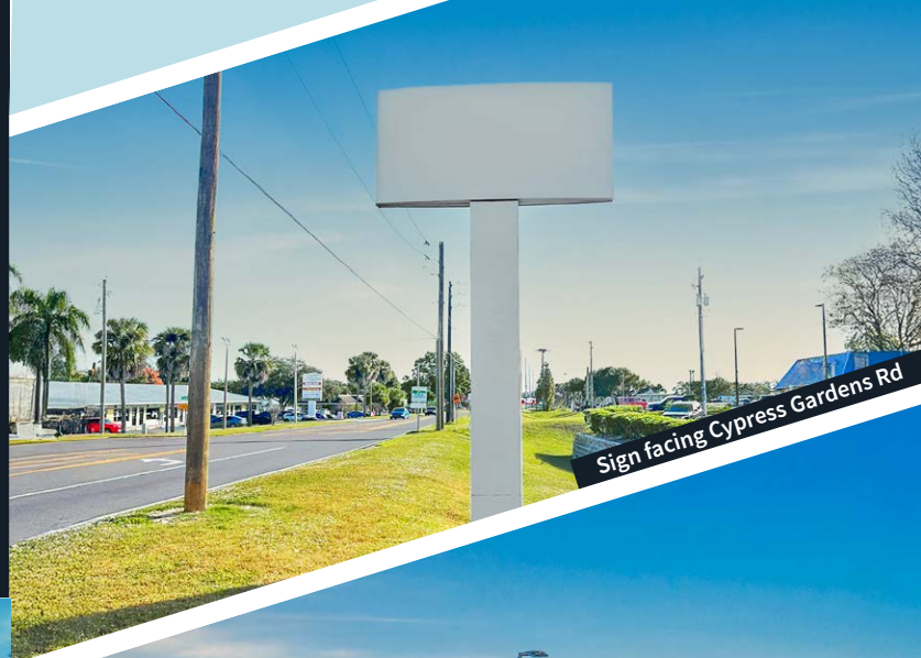
Sign facing Cypress Gardens Rd