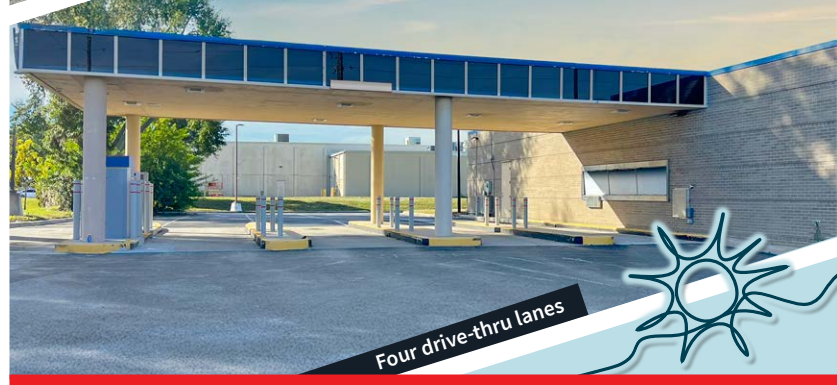
Four drive-thru lanes