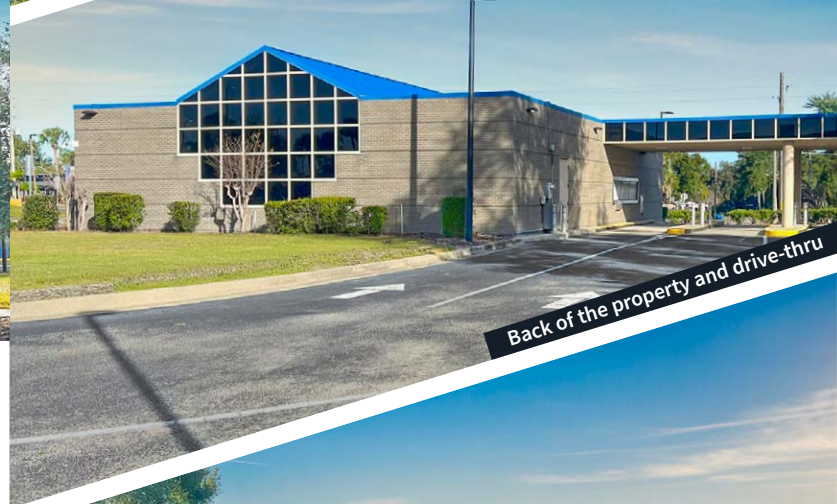
Back of the property and drive-thru