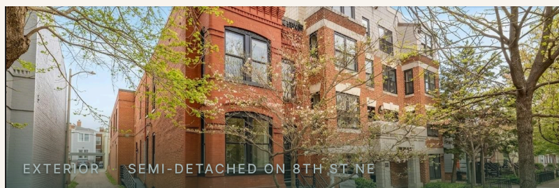
EXTERIOR SEMI-DETACHED ON 8TH ST NE

Private residence, professional offices, political & diplomatic use, event programming, etc.