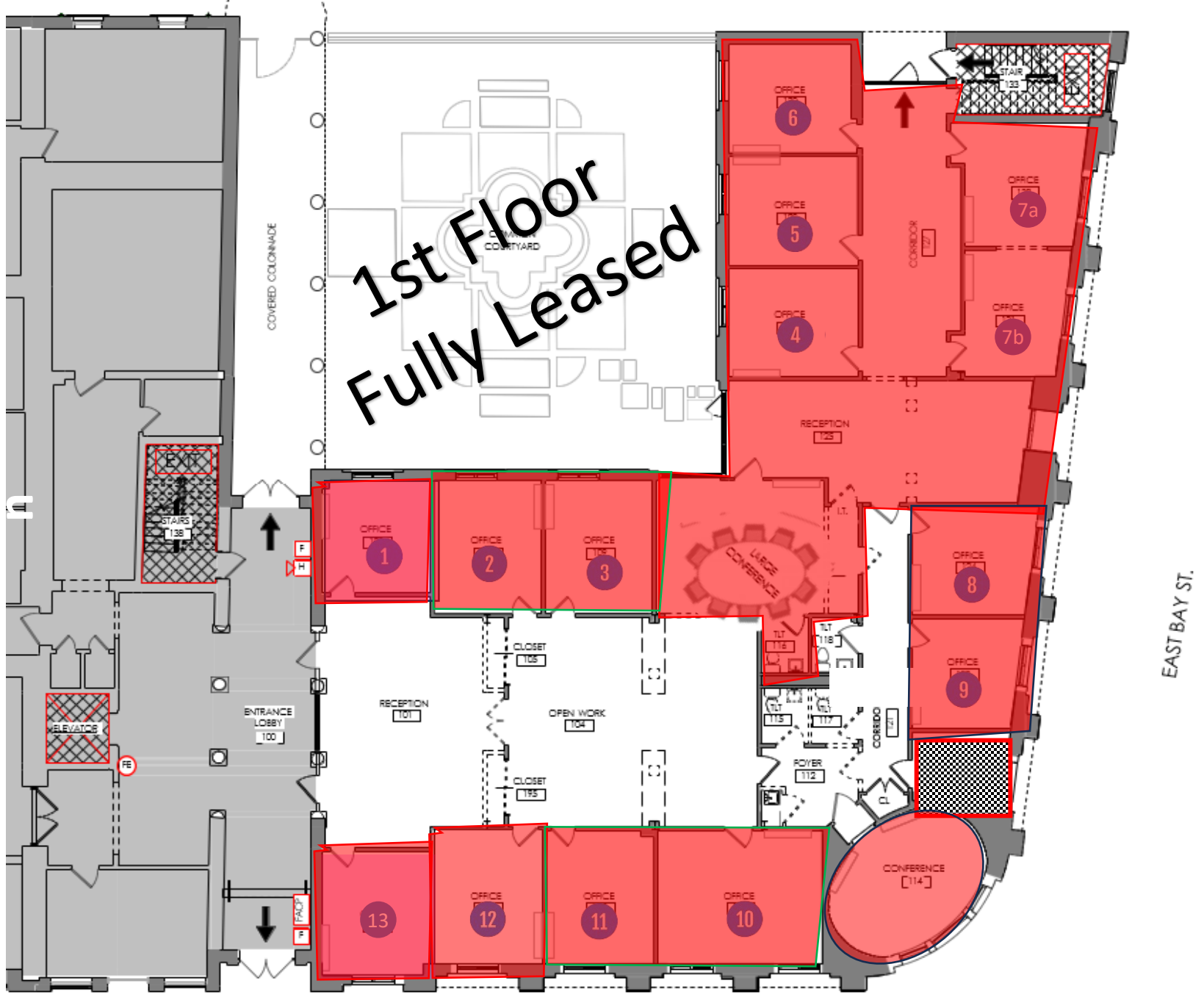
FIRST FLOOR 5,377 SF