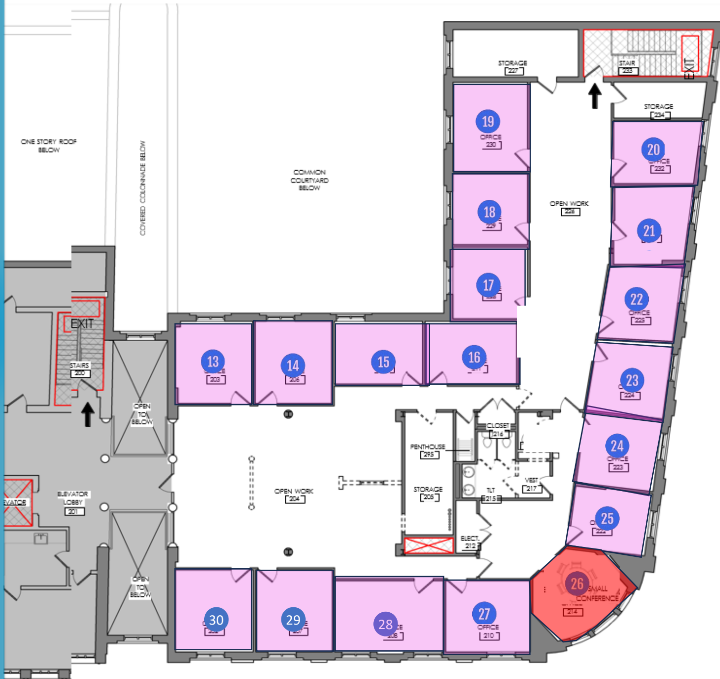
SECOND FLOOR 5,556 SF