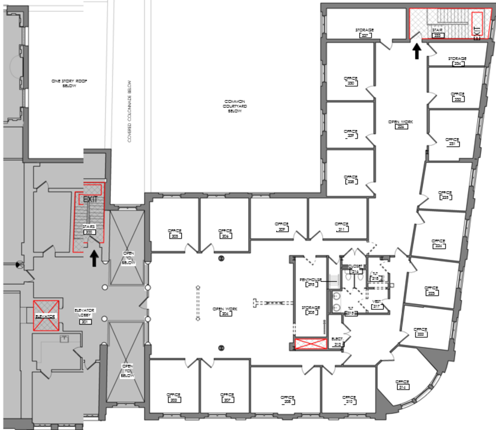
SECOND FLOOR 5,556 SF