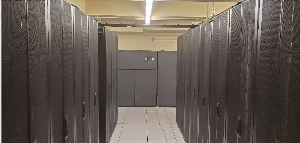
20 Network Rack Cabinets