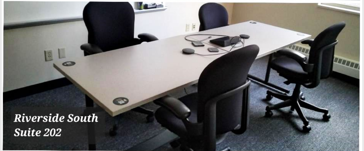
Riverside South Suite 202