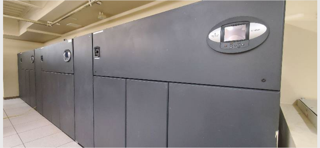
3 Liebert Emerson Downflow Cooling Systems