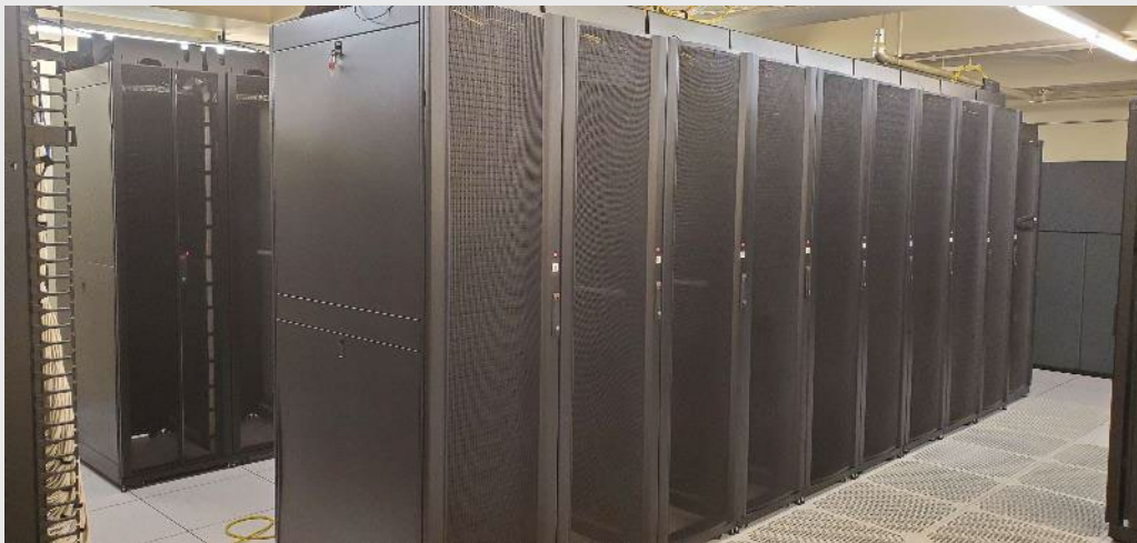
UPS Backup System