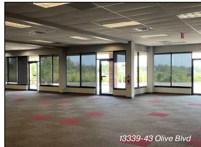
13339-43 Olive Blvd