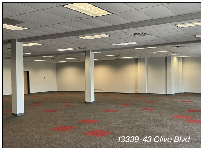
13339-43 Olive Blvd