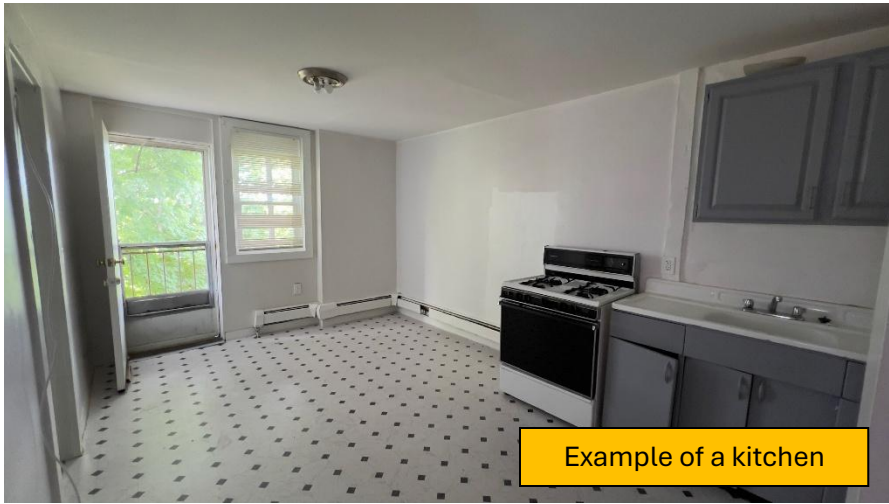
Example of a kitchen