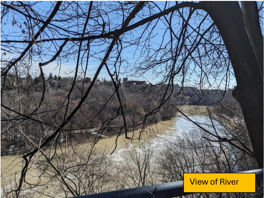
View of River