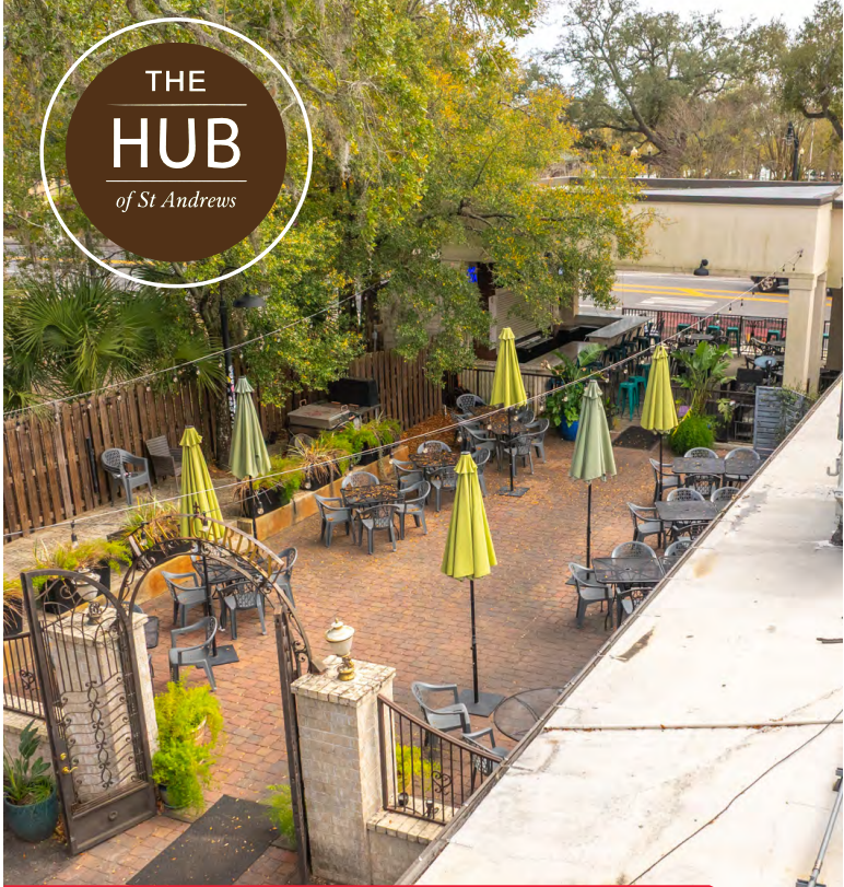
Flagship Hospitality Space at "The Hub"