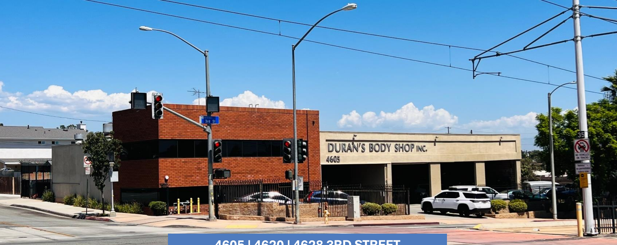
4605 | 4620 | 4628 3RD STREET