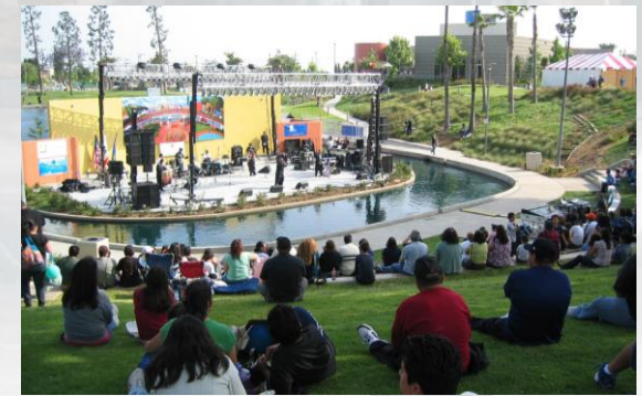
CIVIC CENTER PARK