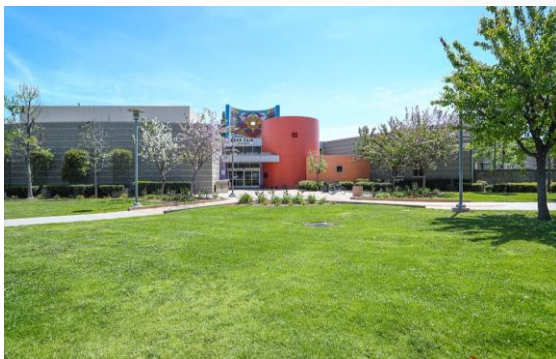
EAST LA LIBRARY