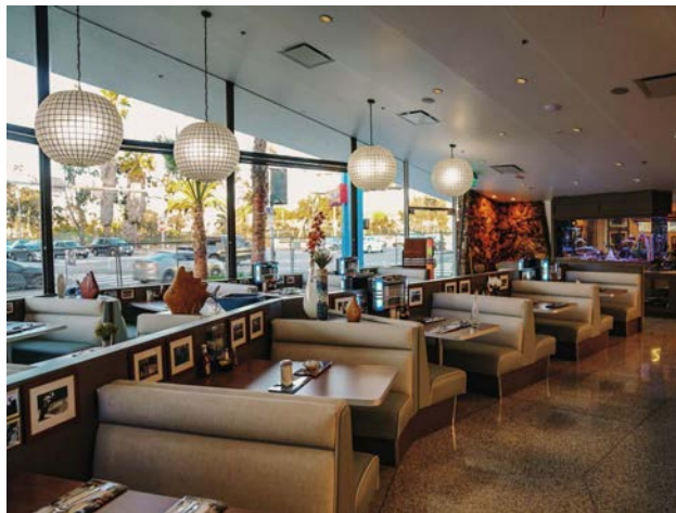
MELS DRIVE IN / 1670 LINCOLN BLVD