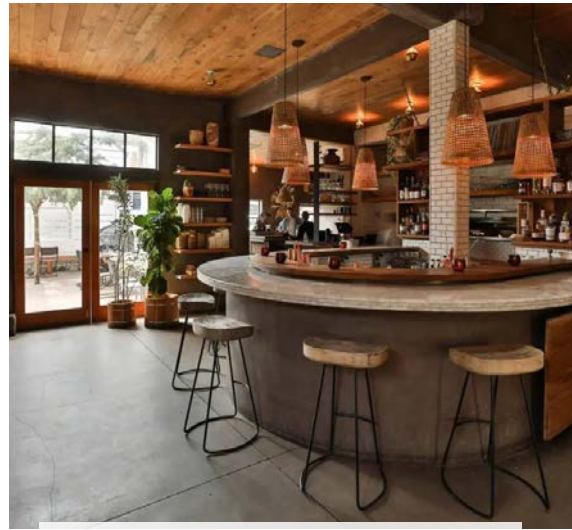
BODEGA WINE BAR / 802 BROADWAY