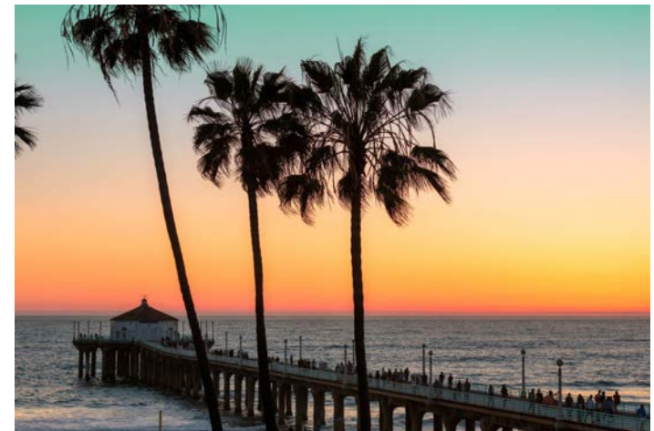
SANTA MONICA BEACH