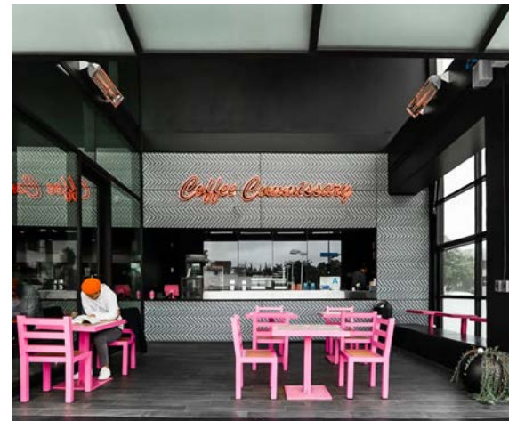
COFFEE COMMISSARY / 1402 SANTA MONICA