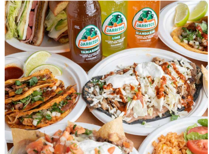
TACOS POR FAVOR / 1408 OLYMPIC BLVD