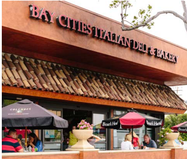
BAY CITIES DELI / 1517 LINCOLN BLVD

WALKING DISTANCE TO THE BEST OF THE WEST SIDE