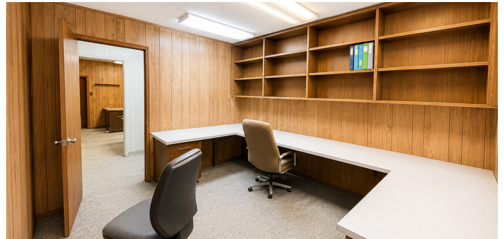
Digitally edited using AI to remove clutter/debris.