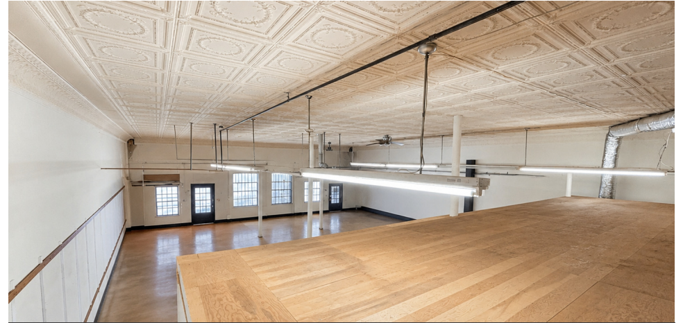
Digitally edited using AI to remove clutter/debris.