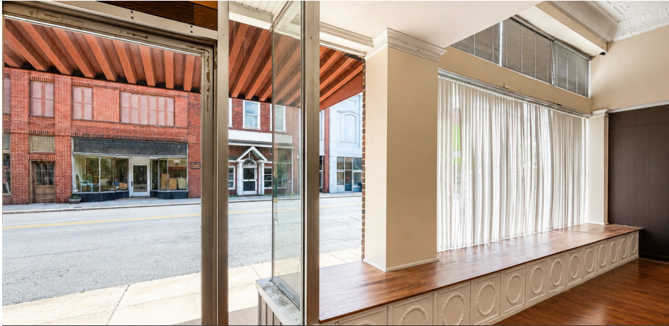
Digitally edited using AI to remove clutter/debris.