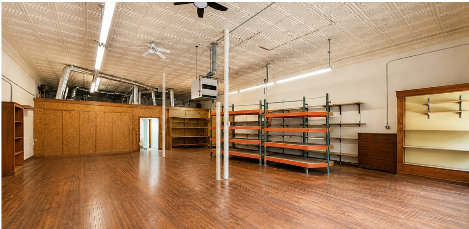
Digitally edited using AI to remove clutter/debris.