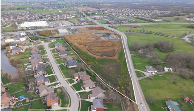
Drone footage of the property.

Corner of Keene Rd (KY169) and US27 By-Pass, Nicholasville, Kentucky 40356