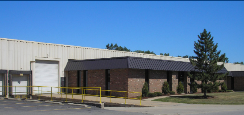
...Centax I 1000-1020 Valley Belt Rd., Brooklyn Heights, Ohio