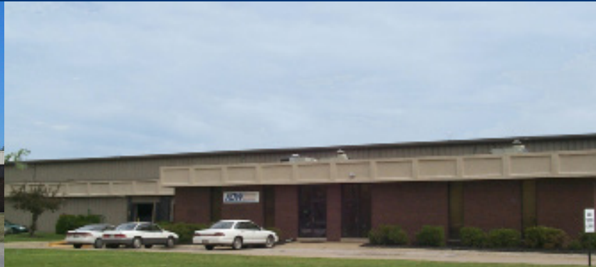
...Centax II 900-998 Valley Belt Rd., Brooklyn Heights, Ohio

“Flexible Spaces in All the Right Places” is what Fogg had in mind when designing their large portfolio of office, industrial and office/warehouse (flex) properties. Strategically located near major freeways in northeast Ohio, Fogg’s properties offer flexible floor plans, truck access and lease terms, as well as expansion opportunities for their growing customers.