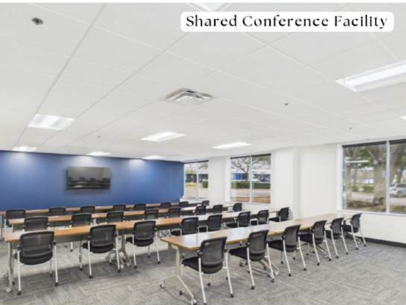
Shared Conference Facility