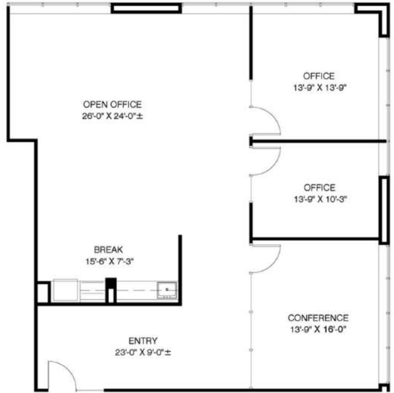
SPEC SUITE 255 - 1,213 RSF