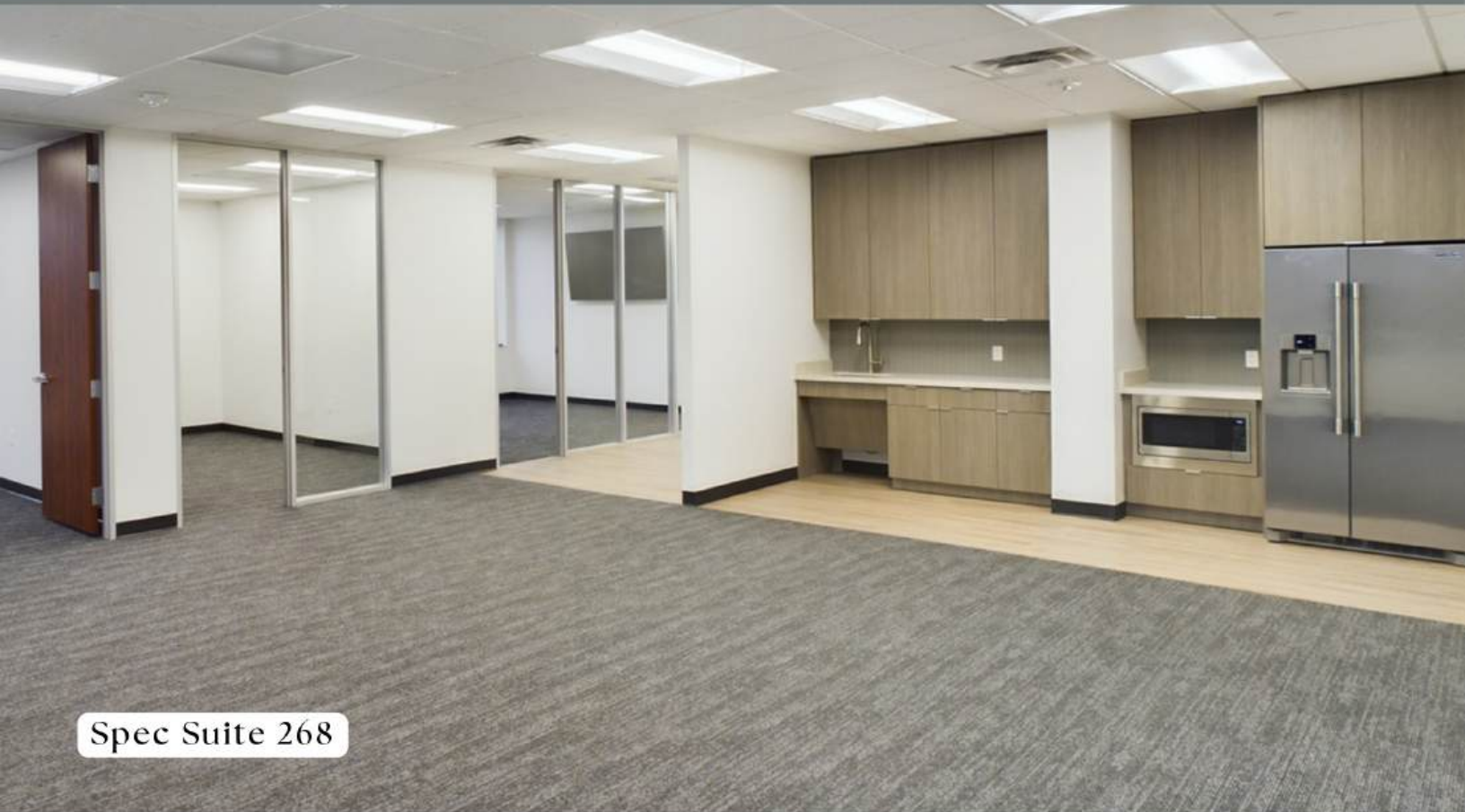
Spec Suite 268