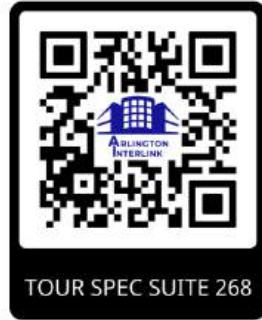
SUITE 268 - 2,044 RSF