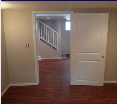
Suite B (Below Grade)