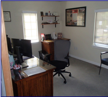
Suite A (Main Level)