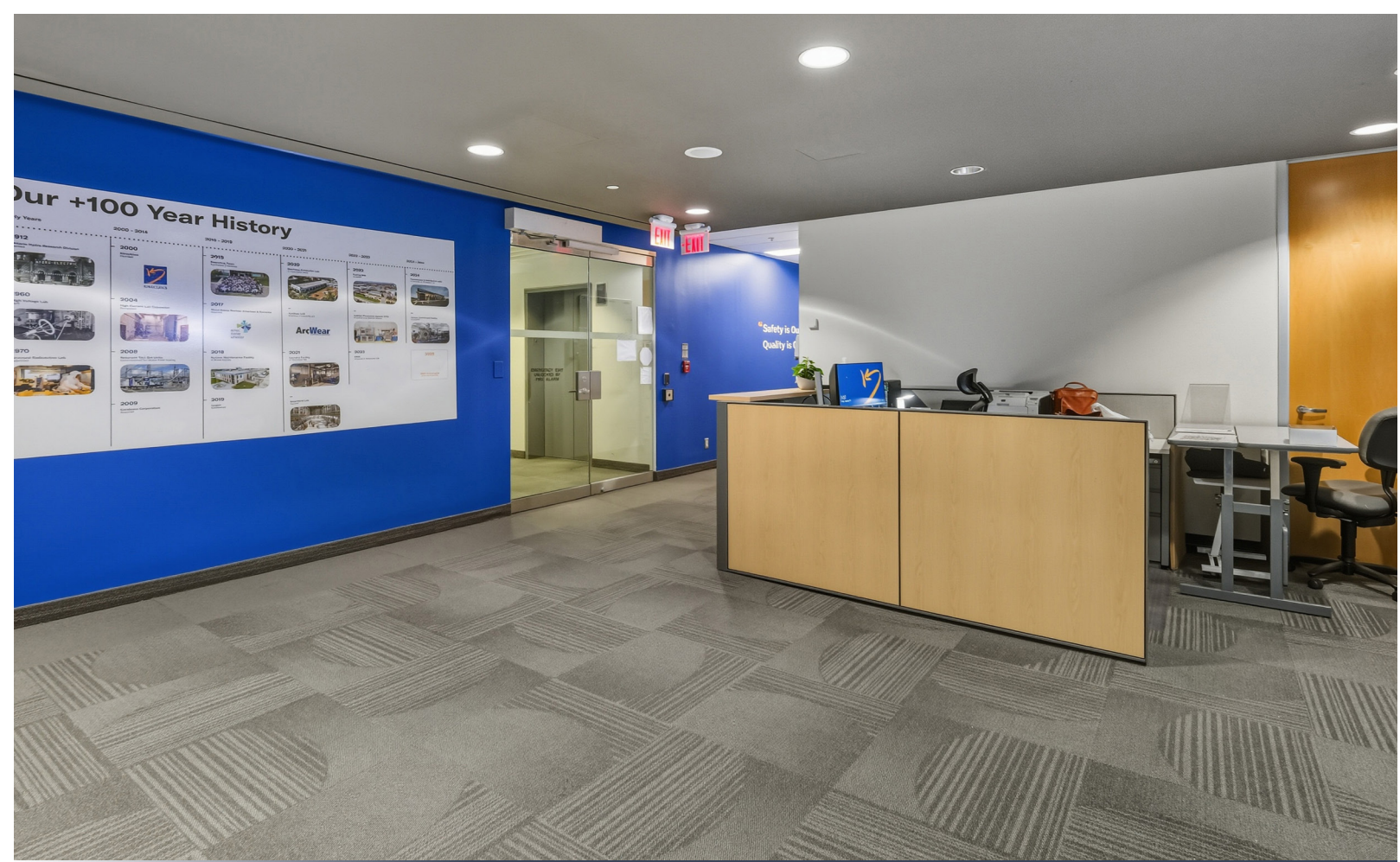
Well-connected downtown office space