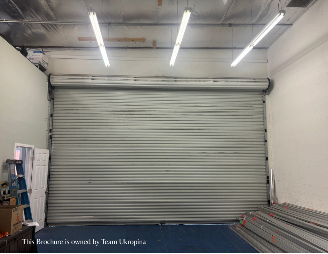
This Brochure is owned by Team Ukropina