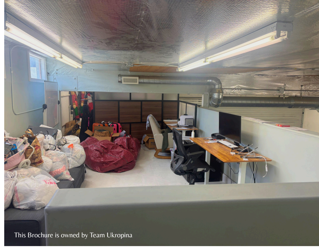
This Brochure is owned by Team Ukropina