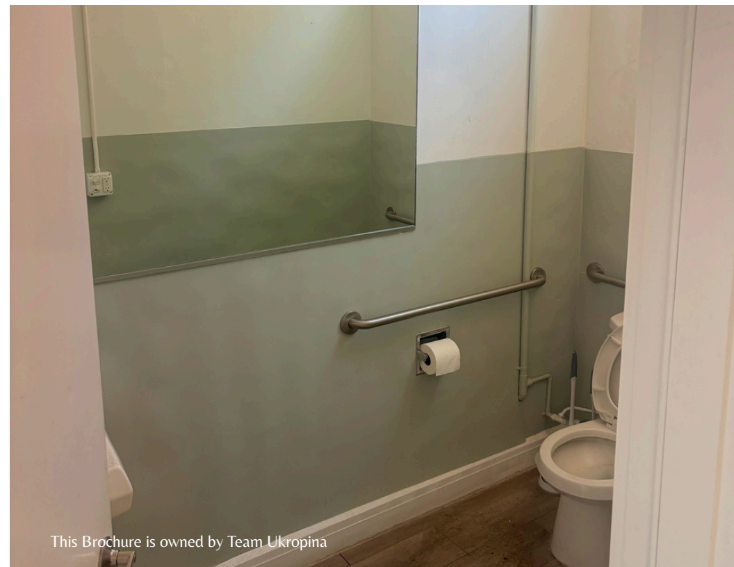
This Brochure is owned by Team Ukropina