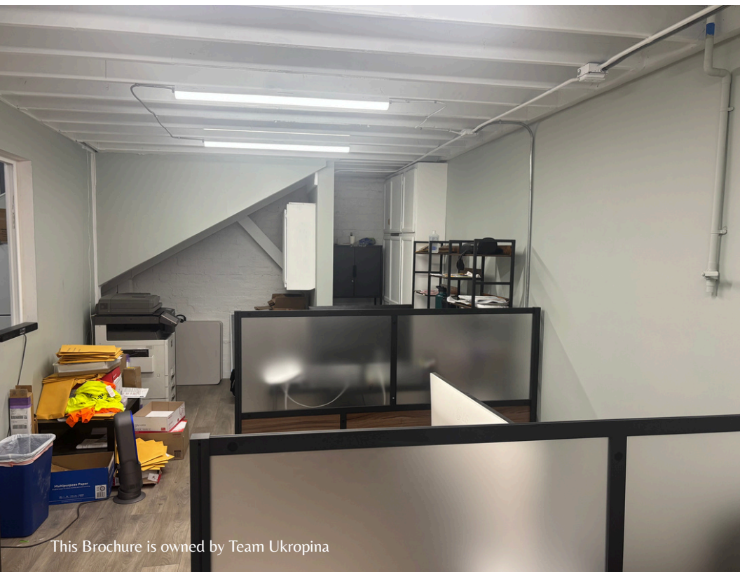
This Brochure is owned by Team Ukropina