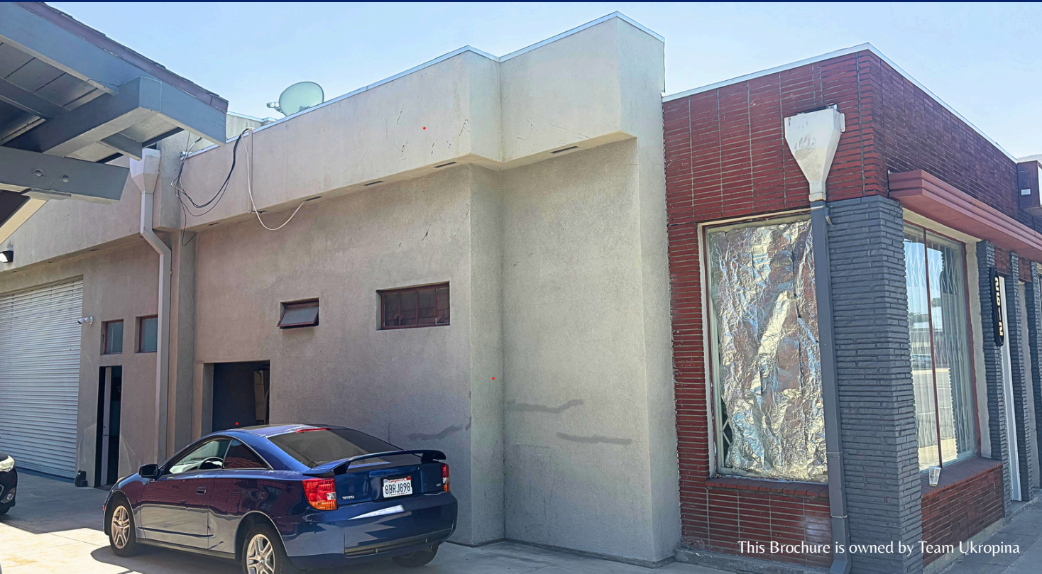
This Brochure is owned by Team Ukropina