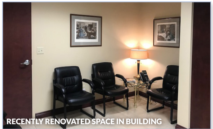
RECENTLY RENOVATED SPACE IN BUILDING