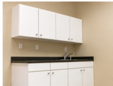
FULL SIZE KITCHEN (NO APPLIANCES PROVIDED)