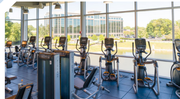
Full-service gym with men's and women's locker rooms with private showers, towel service and Peloton bikes.