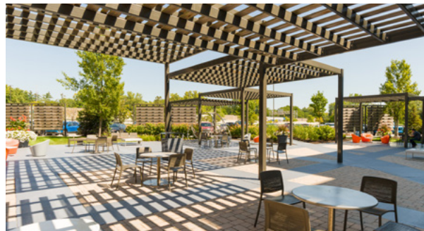
Multiple indoor and outdoor tenant lounges throughout the park with casual seating and beautiful surroundings.