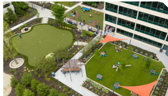
An outdoor oasis with putt-putt, table tennis, corn hole, billiards, music, and relaxing seating areas.