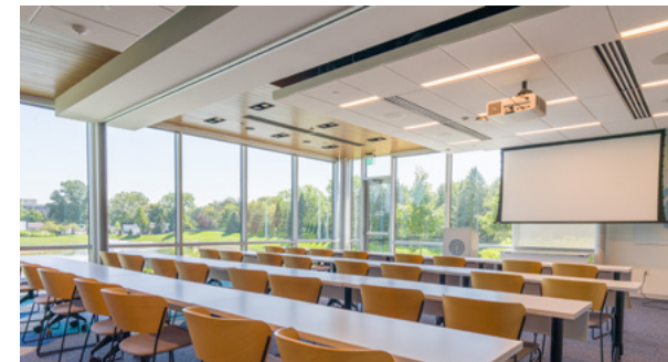
Multiple tech-savvy meeting spaces and conference rooms for up to 120 people.