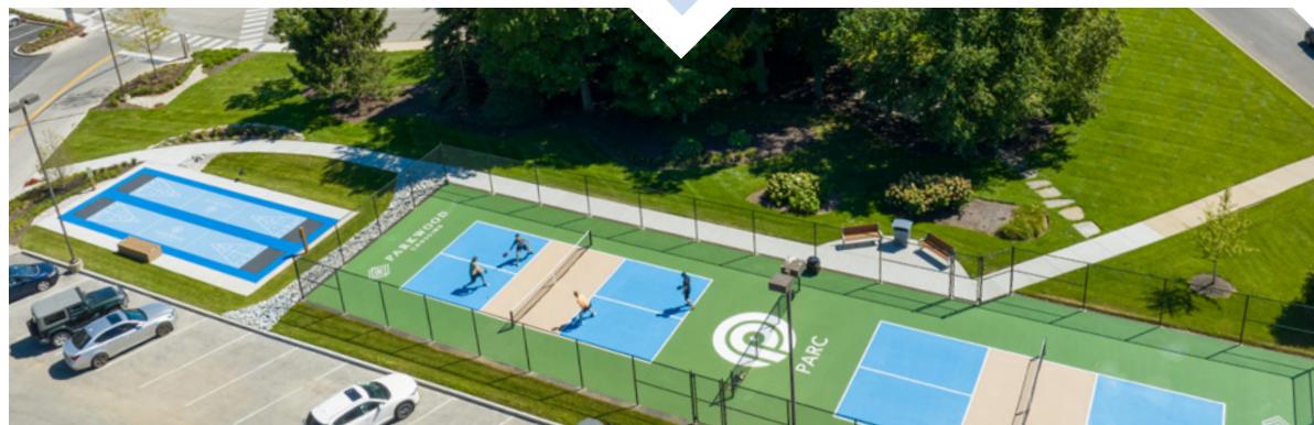
Two outdoor, gated pickleball courts and two shuffleboard courts.