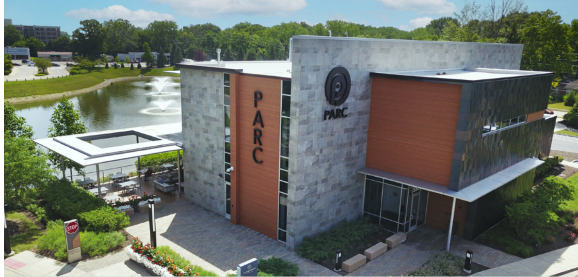
A two-story, 14,000 SF amenity center featuring a 6,000 SF fitness center with locker rooms and showers, a state-of-the-art conference and training room, boardroom, and gourmet café and tenant lounge with fireplace and outdoor wraparound deck with lake views.