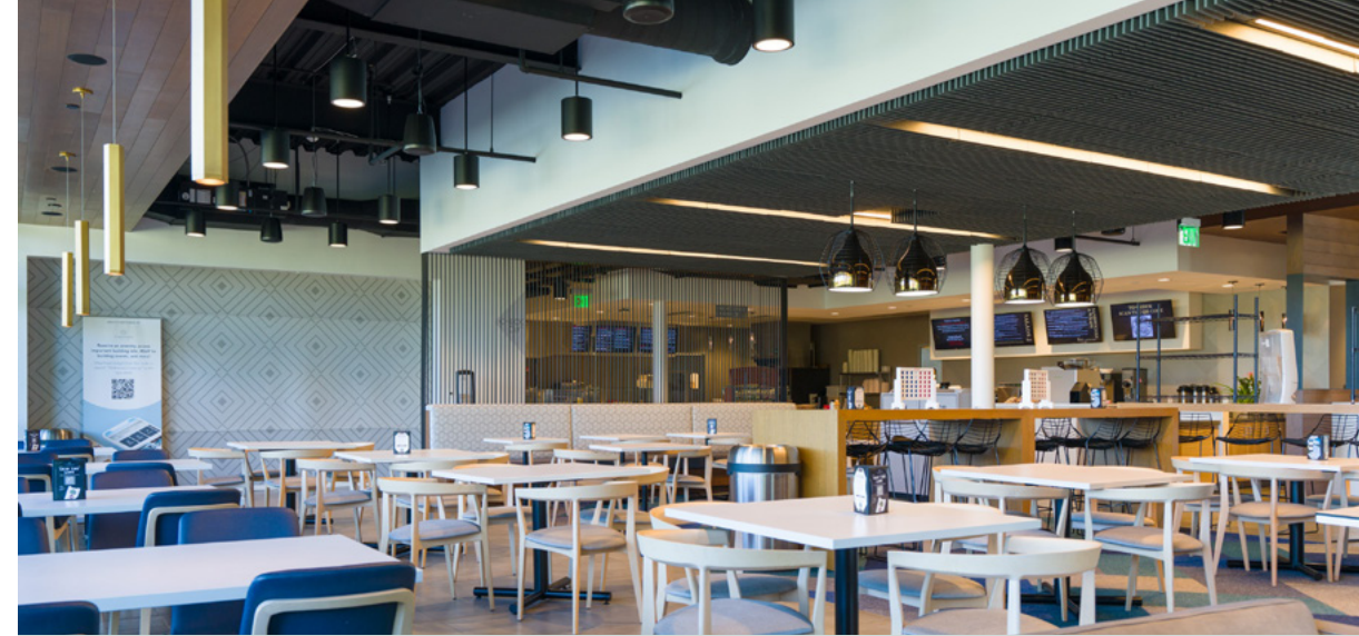
Enjoy delicious lunch and coffee drinks made to order at Labor District Café offering dine-in, carryout and online ordering options.