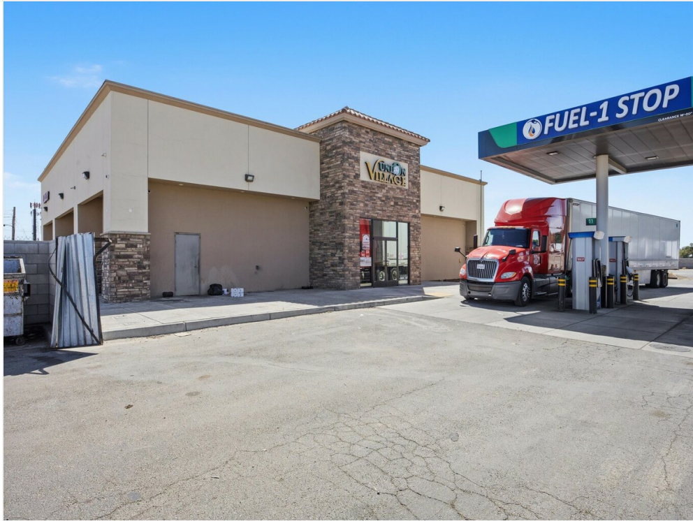
46-Illuminate Photography - 2201 S Union Ave - 39