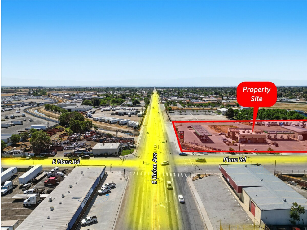
03-Illuminate Photography - A