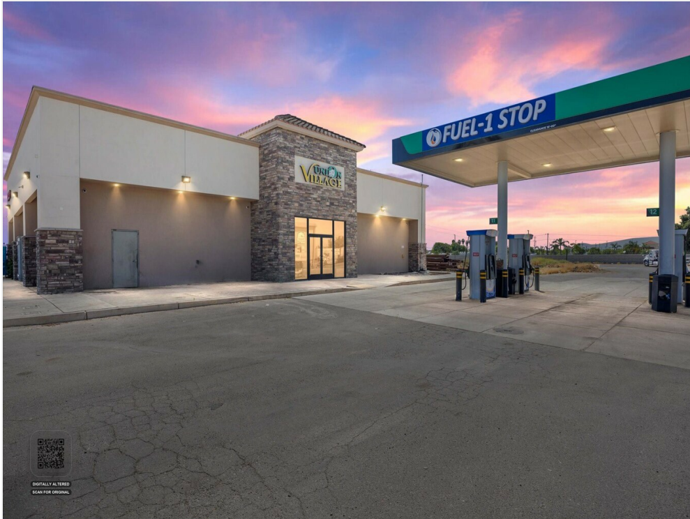
02-Illuminate Photography - 2201 S Union Ave