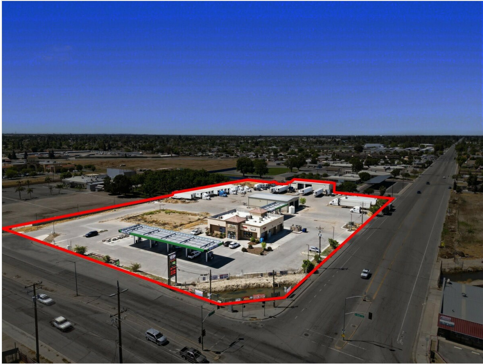
05-Illuminate Photography - D