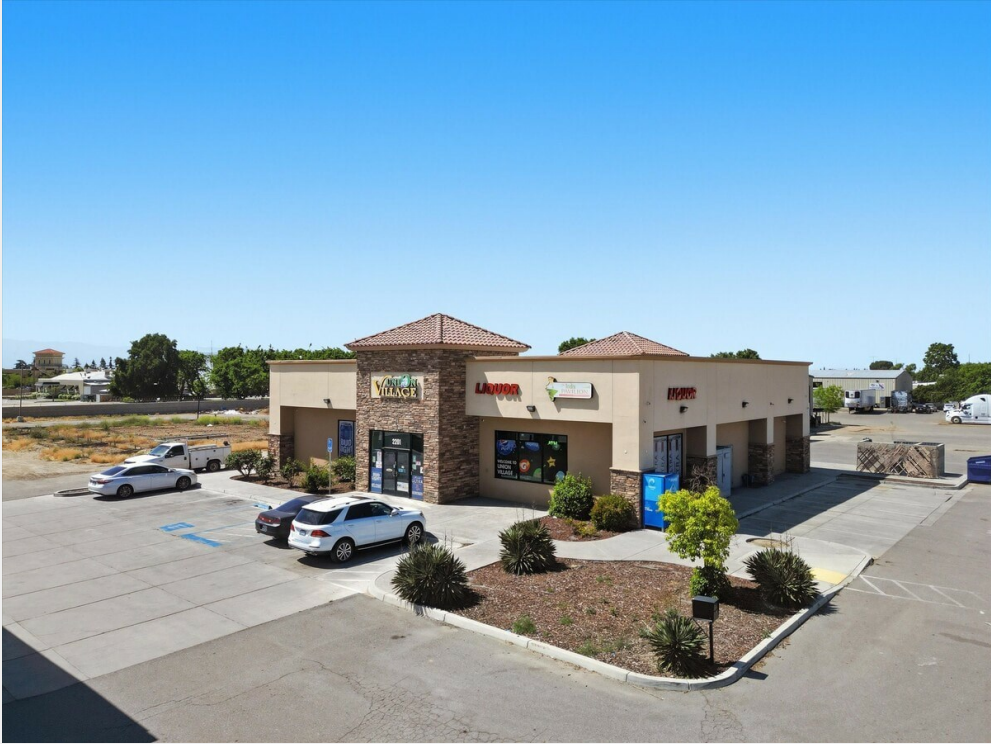
18-Illuminate Photography - 2201 S Union Ave