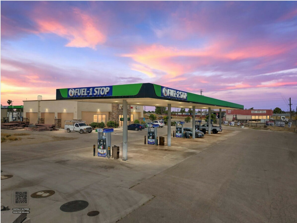
01-Illuminate Photography - 2201 S Union Ave