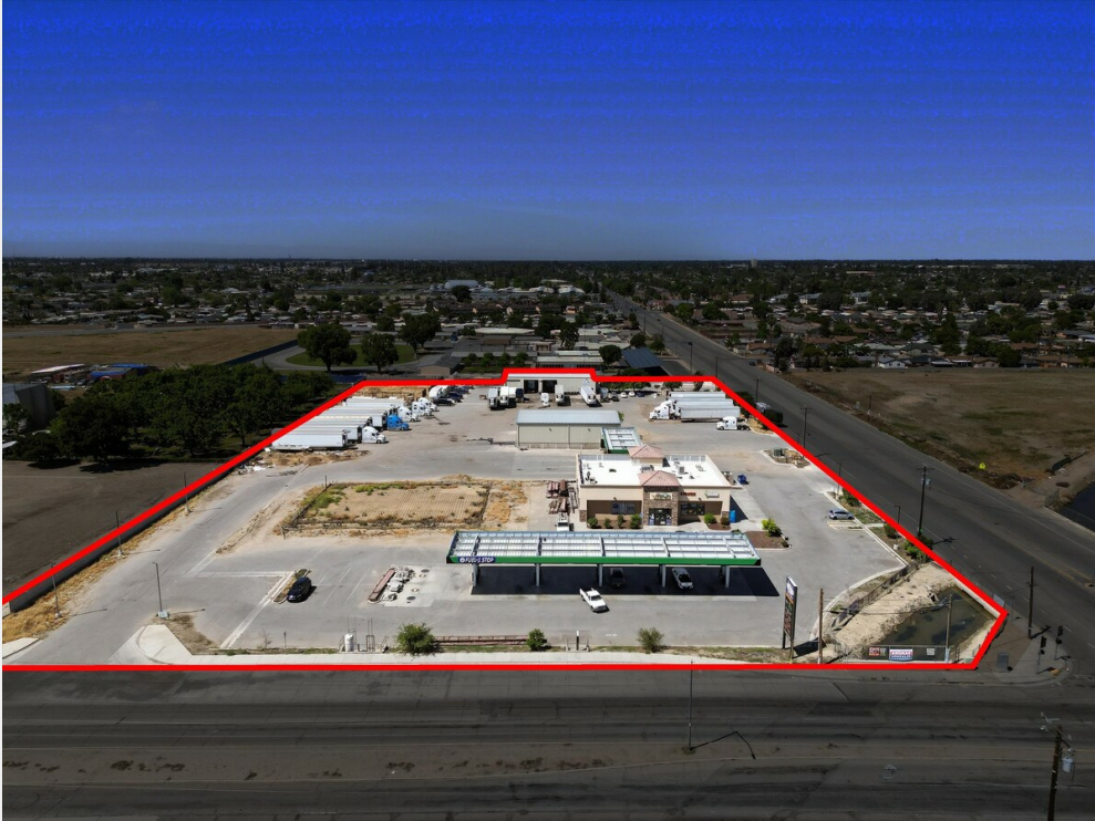
06-Illuminate Photography - B