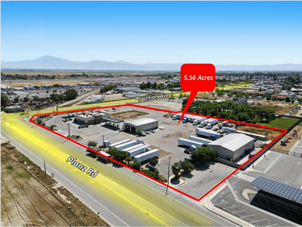
04-Illuminate Photography - C