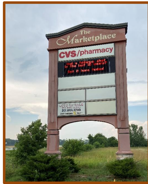
2 Pylon Signs I-69/SR 37 & Fairview Rd

Less Than 1 Mile From County Line Rd Interchange