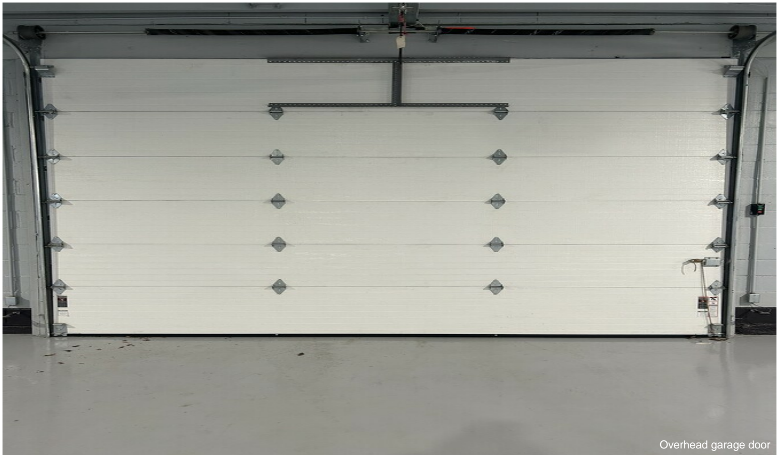
Overhead garage door