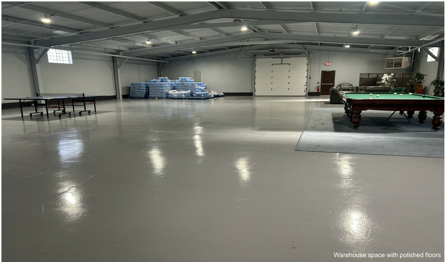
Warehouse space with polished floors