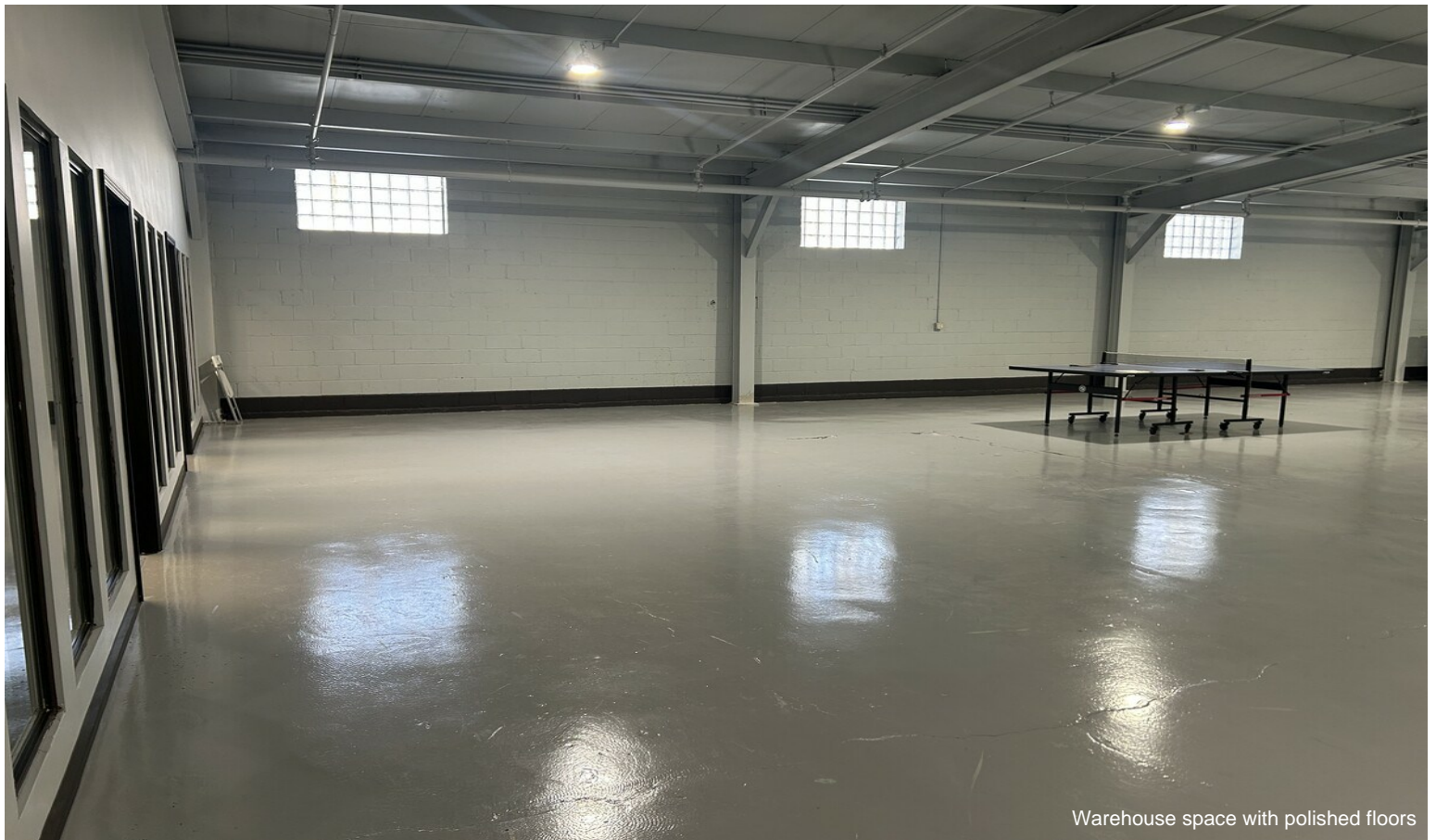
Warehouse space with polished floors