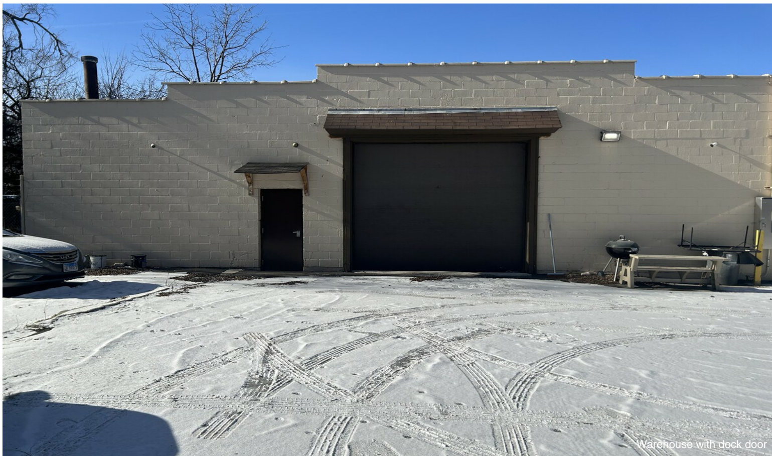
Warehouse with dock door