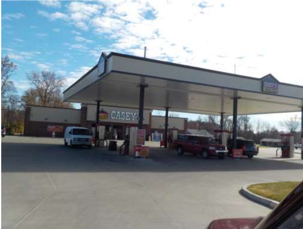
Casey's General Store