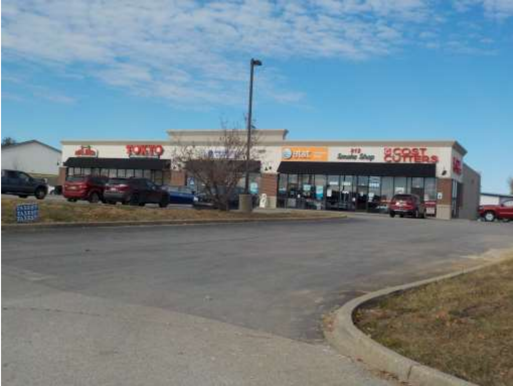
Papa Johns, Tokyo Japanese Steakhouse, AT & T, Cost Cutters