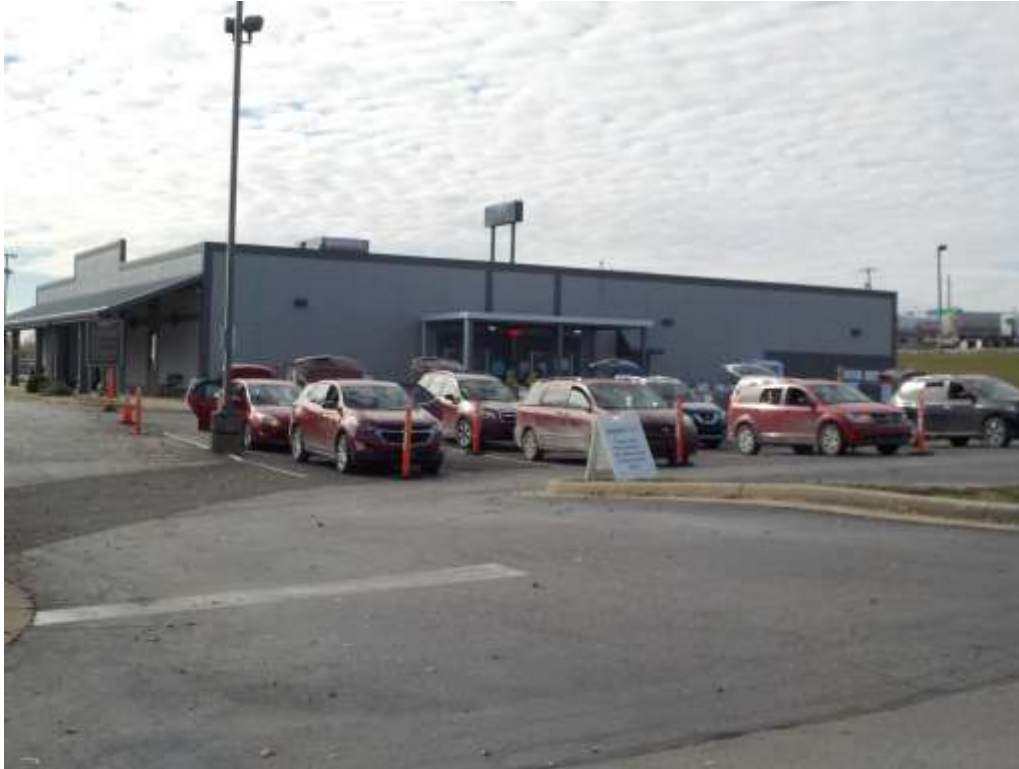
Amazon Distribution Center