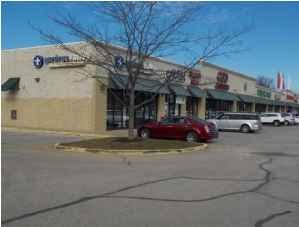
Springs Valley Bank, Cato, Dollar Tree