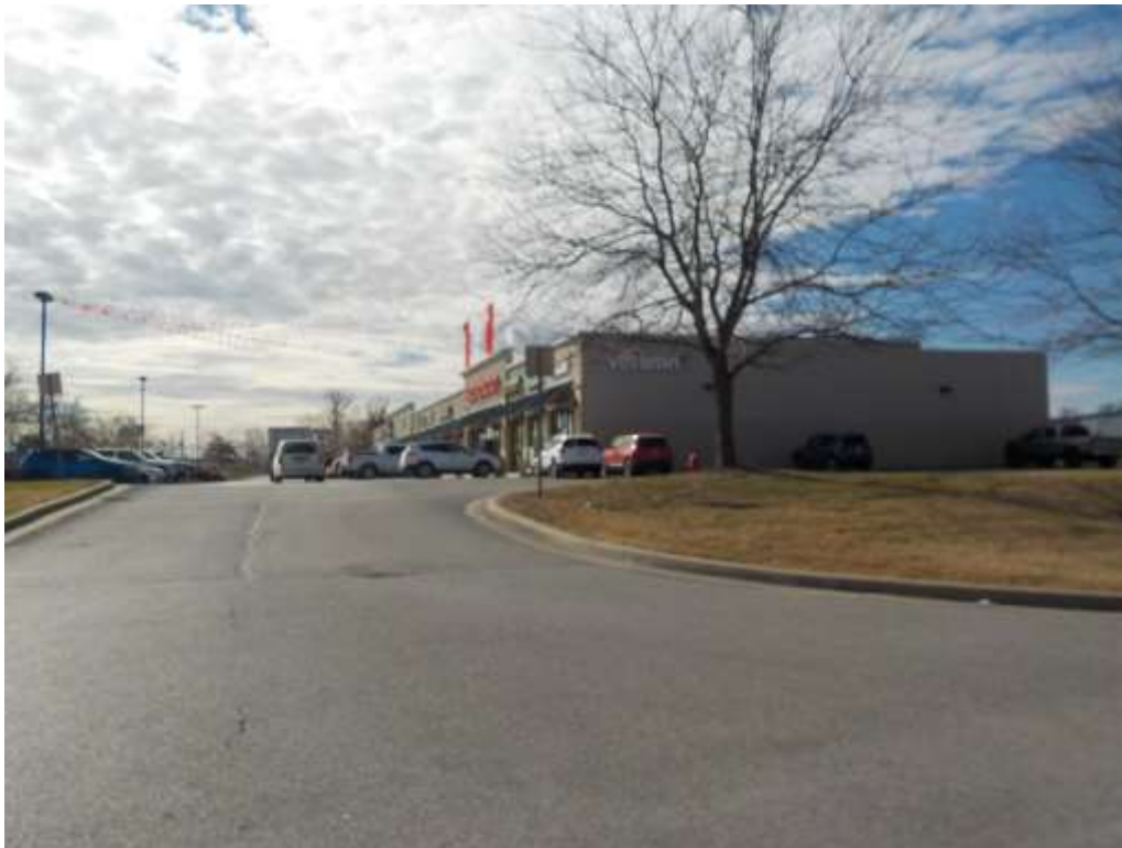
Cato Fashions, H & R Block, Dollar Tree, Verizon, Great Wall Buffet, Shoe Sensation, Springs Valley Bank.