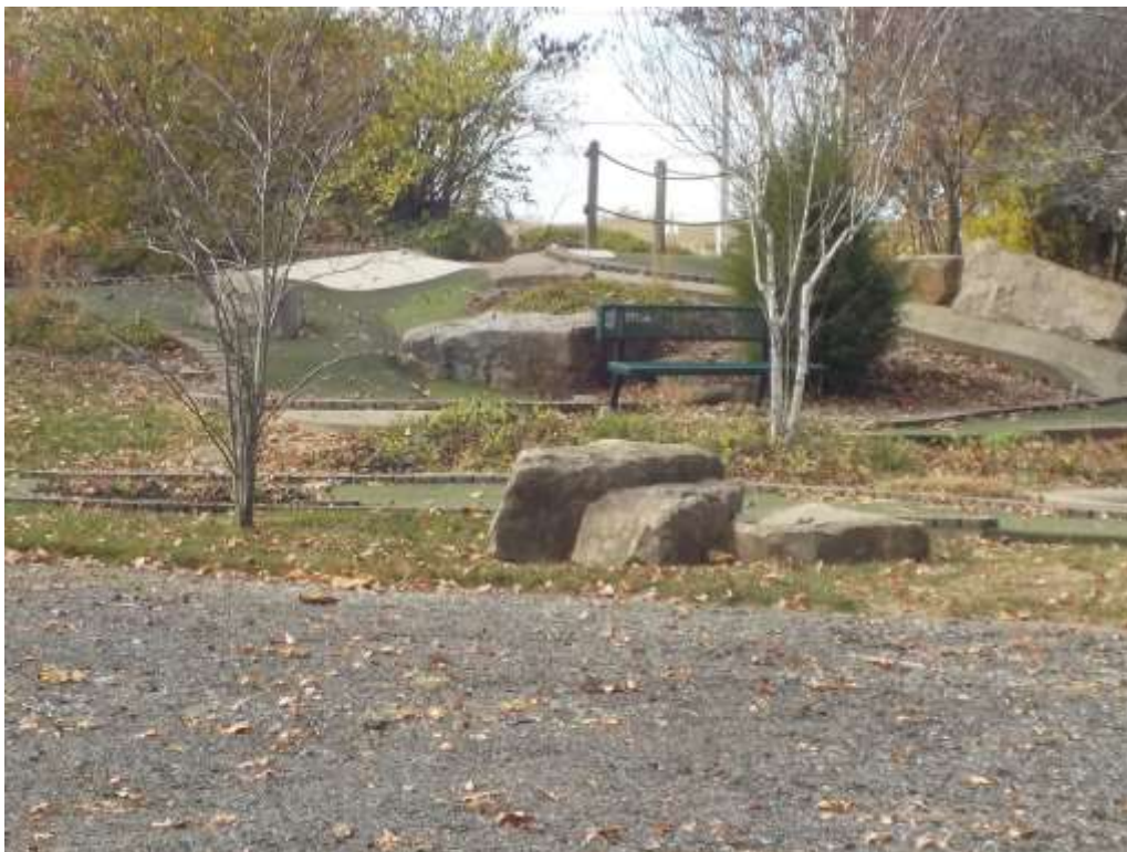
Putter's Bay – Putt Putt Golf