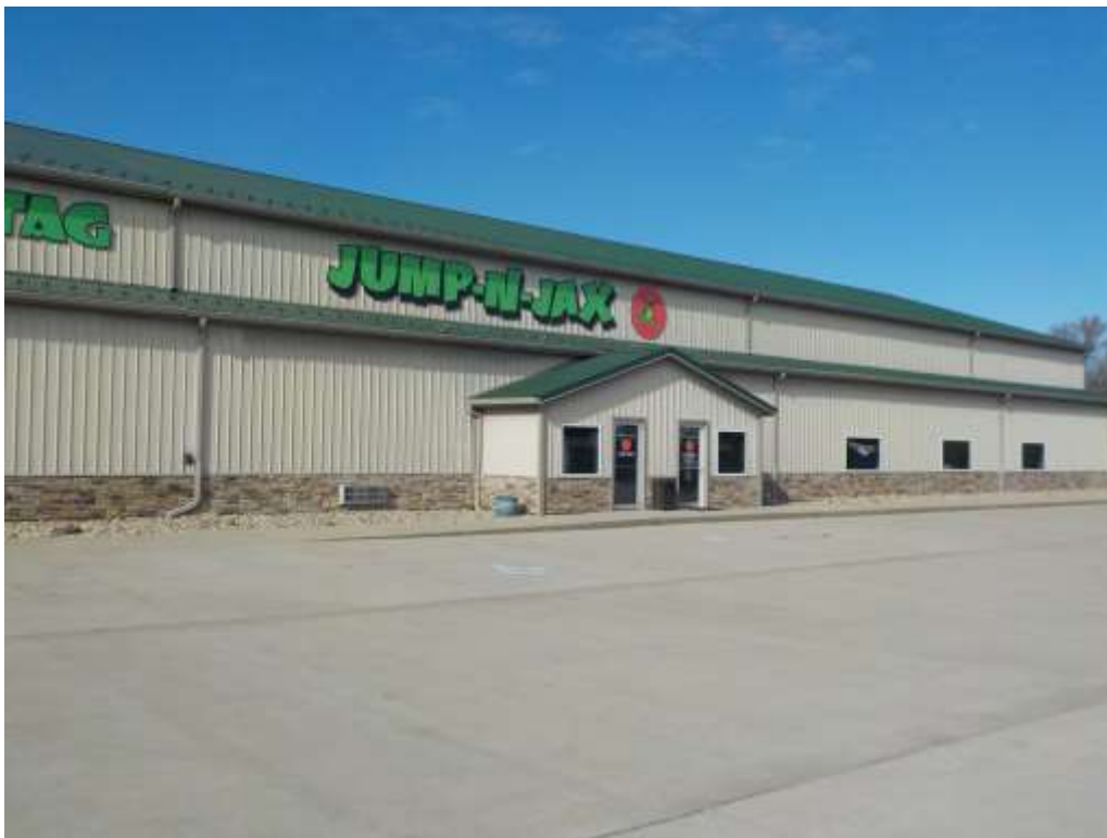
Jump-N-Jax Family Center