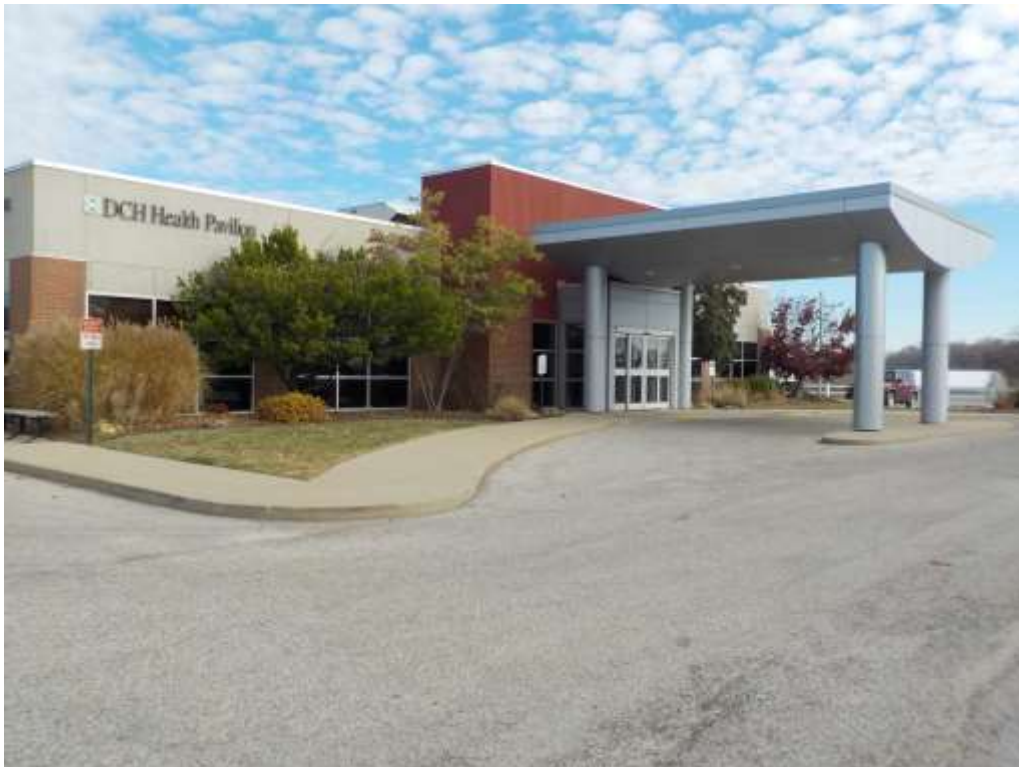
Davie Community Hospital Quick Care