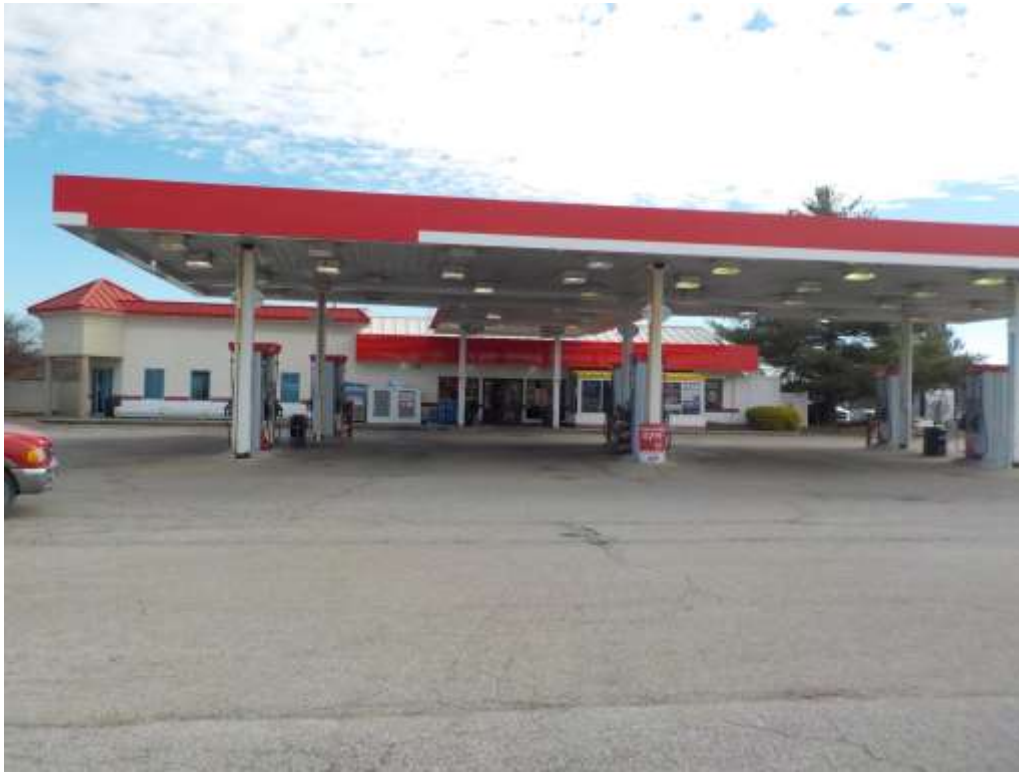
Chuckles Gas Station