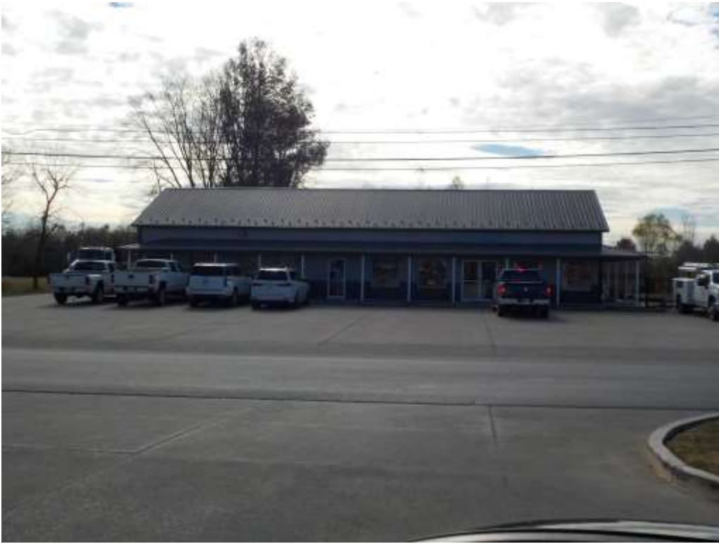
S & S Pools