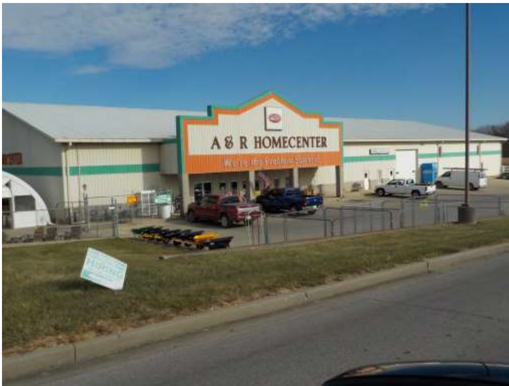
A & R Home Center