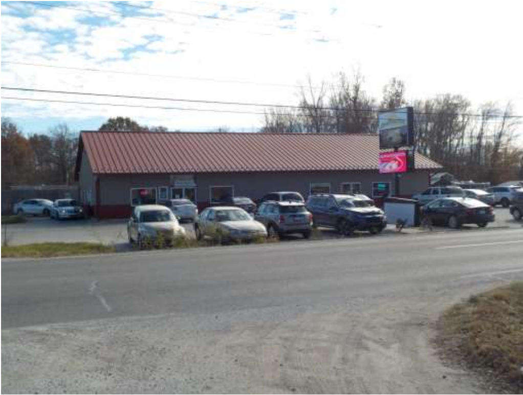
Impressed Coffee Shop