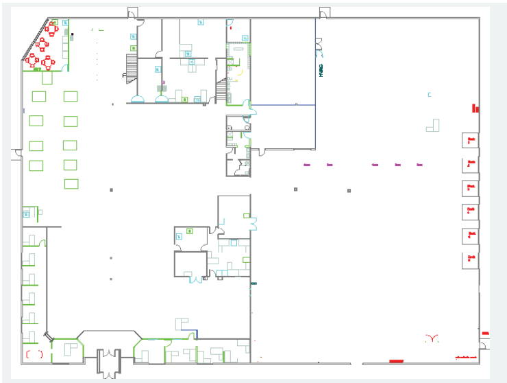
E. 86th Street

© 2026 CBRE, Inc. All rights reserved. This information has been obtained from sources believed reliable, but has not been verified for accuracy or completeness. You should conduct a careful, independent investigation of the property and verify all information. Any reliance on this information is solely at your own risk. CBRE and the CBRE logo are service marks of CBRE, Inc. All other marks displayed on this document are the property of their respective owners, and the use of such logos does not imply any affiliation with or endorsement of CBRE. Photos herein are the property of their respective owners. Use of these images without the express written consent of the owner is prohibited.