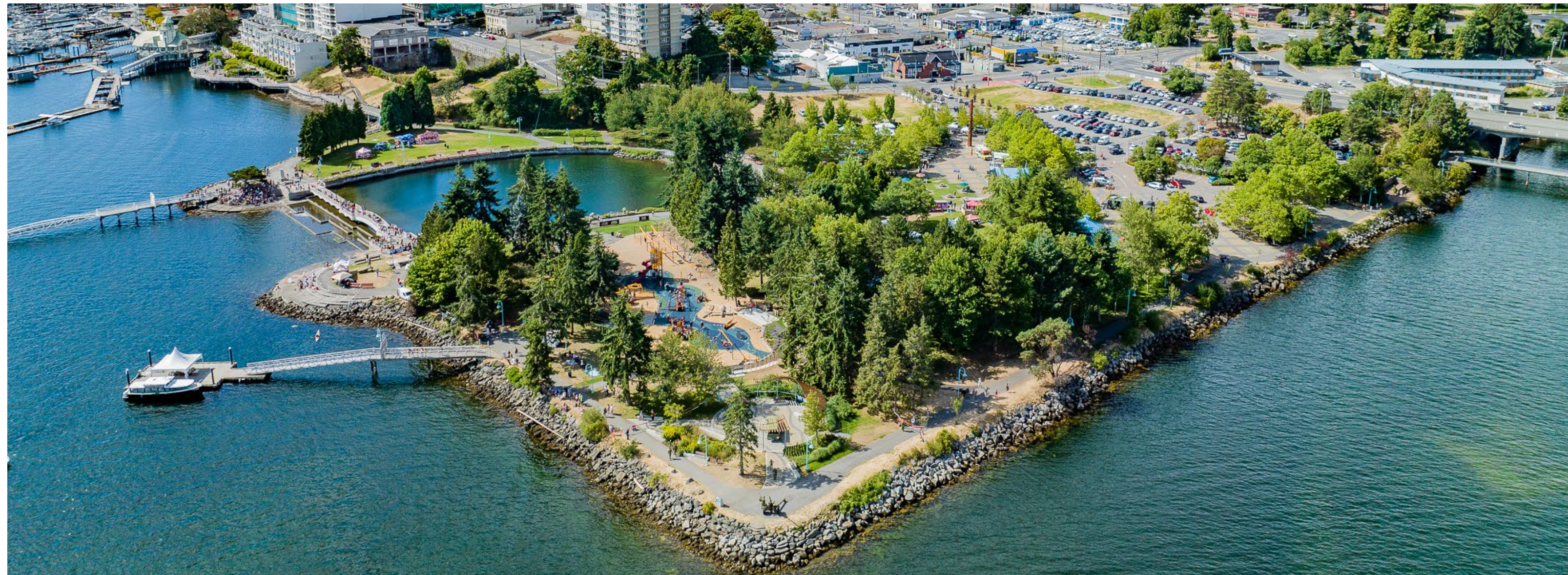
Matteo Sutton Park

Colliers is pleased to present the opportunity to acquire a 12-unit rental apartment building at 160 Stewart Avenue in Nanaimo.