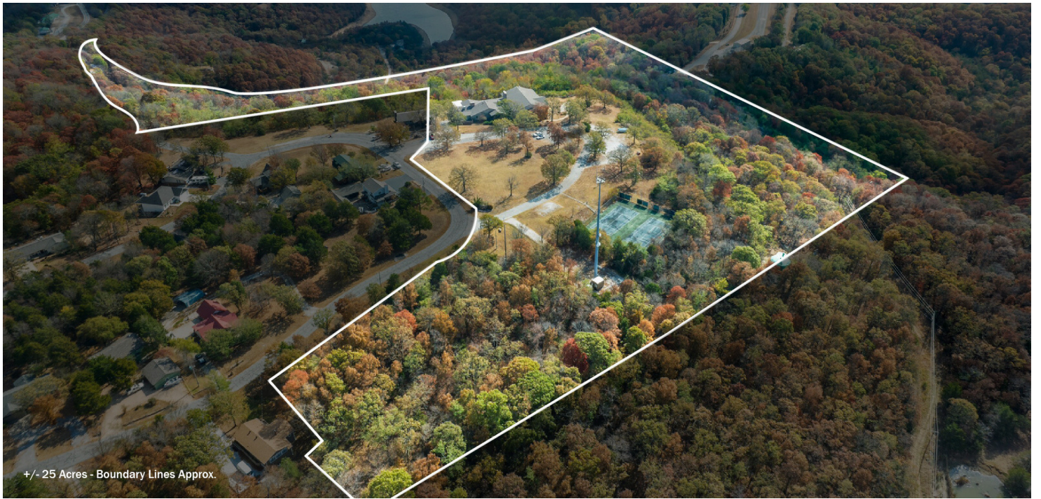
+/- 25 Acres - Boundary Lines Approx.

We obtained the information above from sources we believe to be reliable. However, we have not verified its accuracy and make no guarantee, warranty or representation about it. It is submitted subject to the possibility of errors, omissions, change of price, rental or other conditions, prior sale, lease or financing, or withdrawal without notice. We include projections, opinions, assumptions or estimates for example only, and they may not represent current or future performance of the property. You and your tax and legal advisors should conduct your own investigation of the property and transaction.