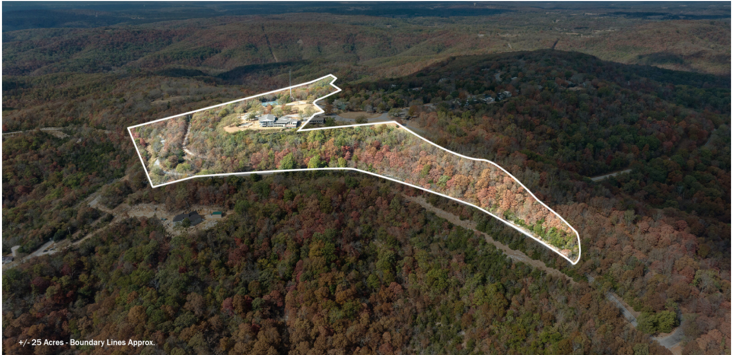
+/- 25 Acres - Boundary Lines Approx.