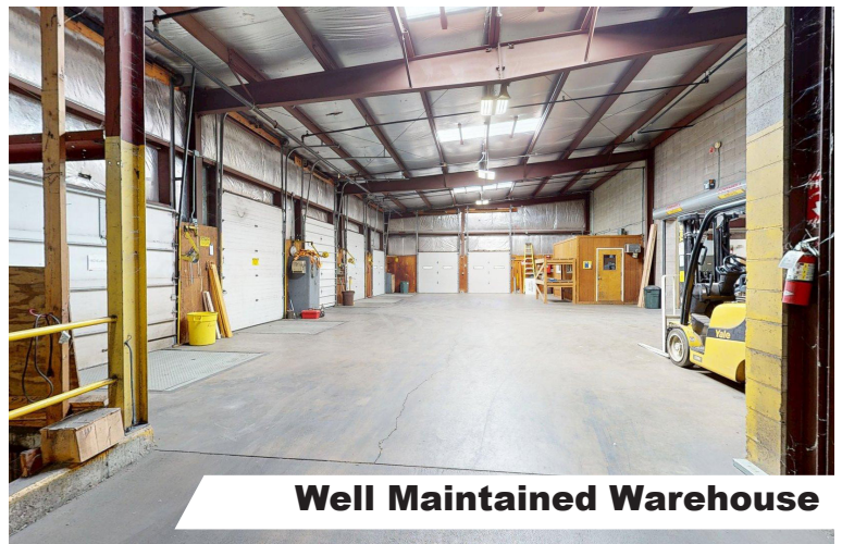
Well Maintained Warehouse