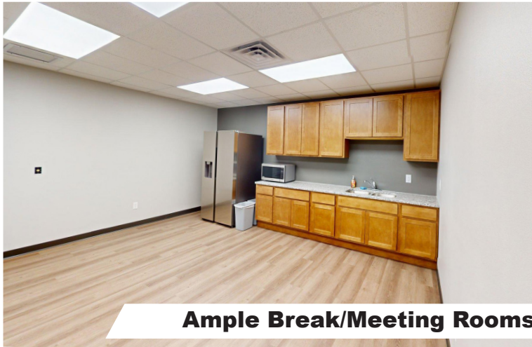
Ample Break/Meeting Rooms