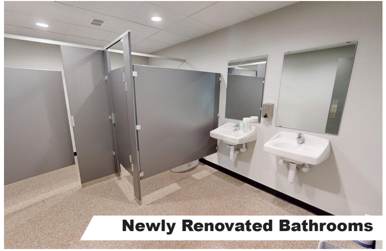
Newly Renovated Bathrooms