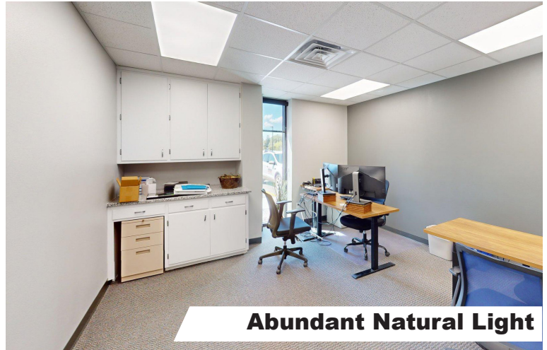
Abundant Natural Light