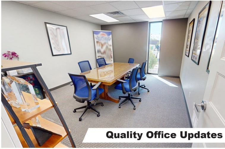
Quality Office Updates