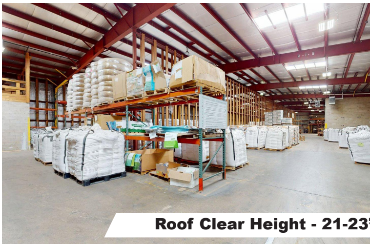
Roof Clear Height - 21-23'