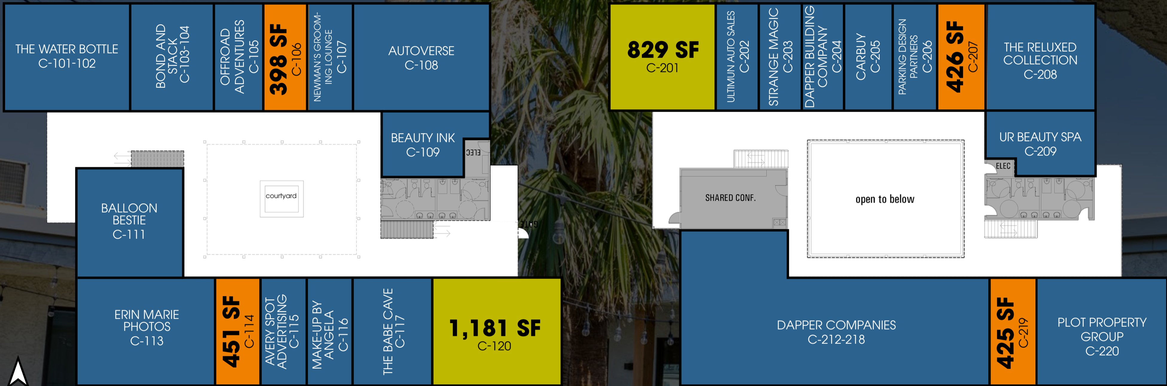
BUILDING "C" FIRST LEVEL