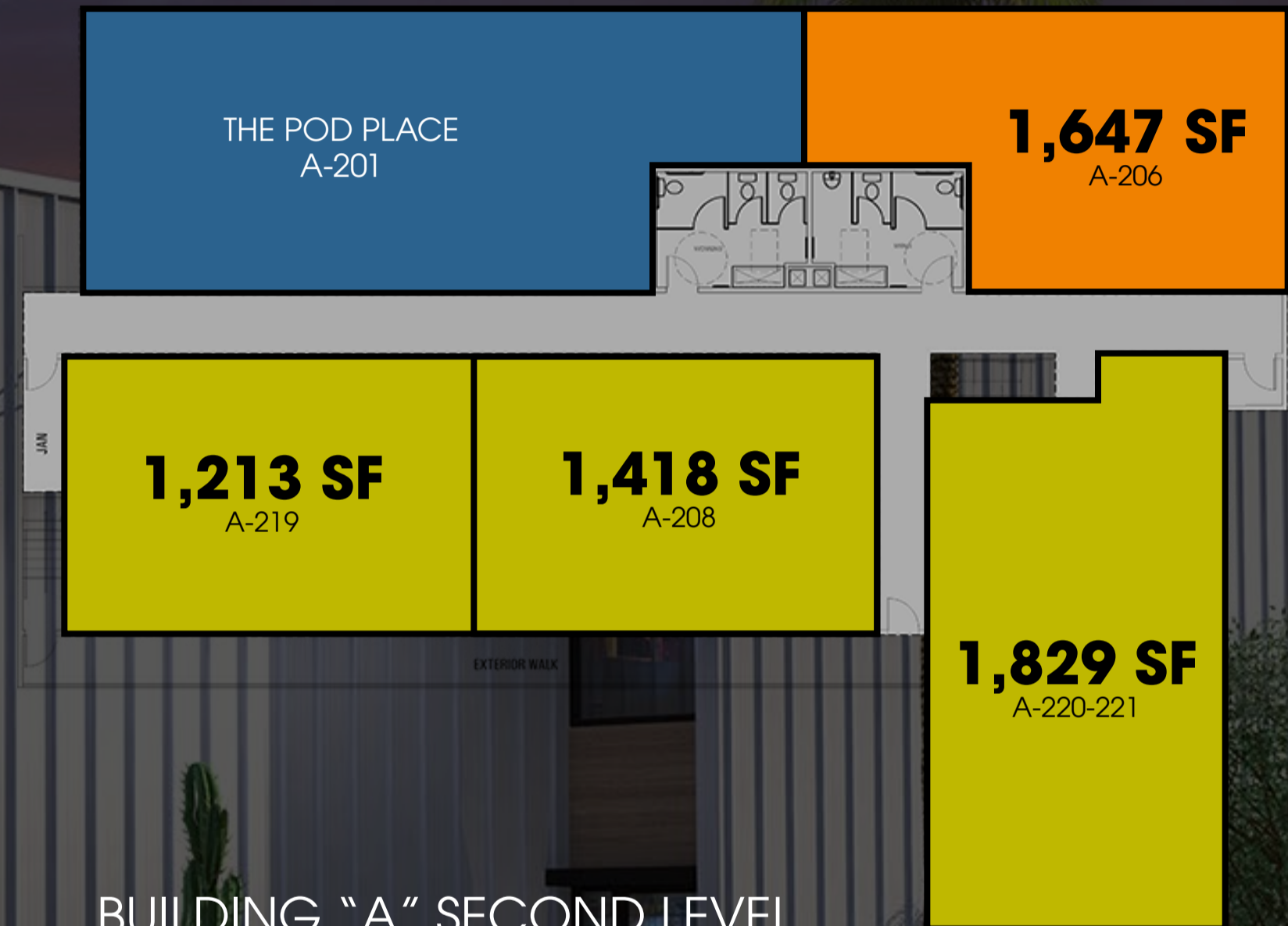
BUILDING "A" SECOND LEVEL

■ LEASED ■ PENDING ■ AVAILABLE ■ MOVE-IN READY