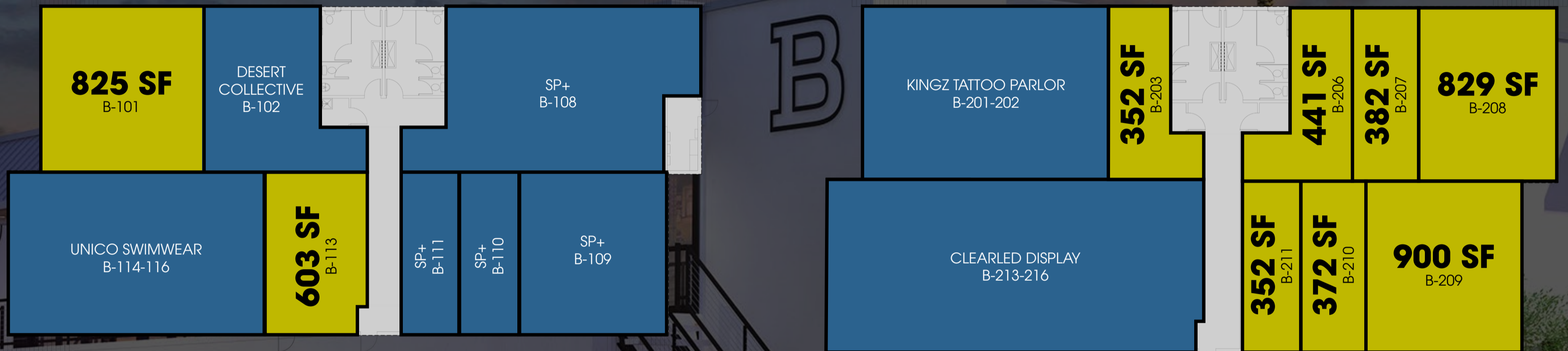
BUILDING "B" FIRST LEVEL