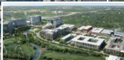
Meridian Mixed Use Development - $2 Billion