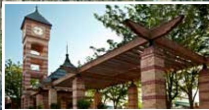
Downtown Overland Park