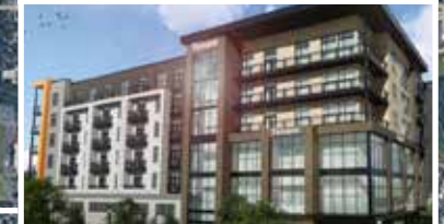
Proposed Met108 Apartments- $60 Million