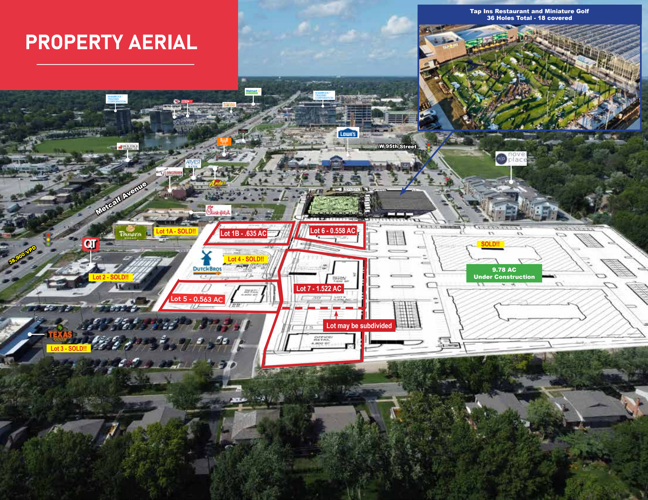
Tap Ins Restaurant and Miniature Golf 36 Holes Total - 18 covered