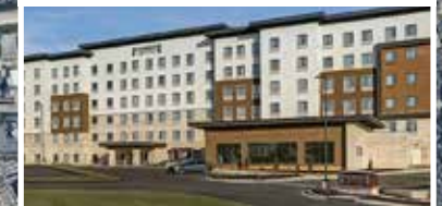
Staybridge Suites (Now Open)- $20 Million