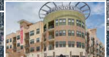
Promontory & SERV $97.5 Million