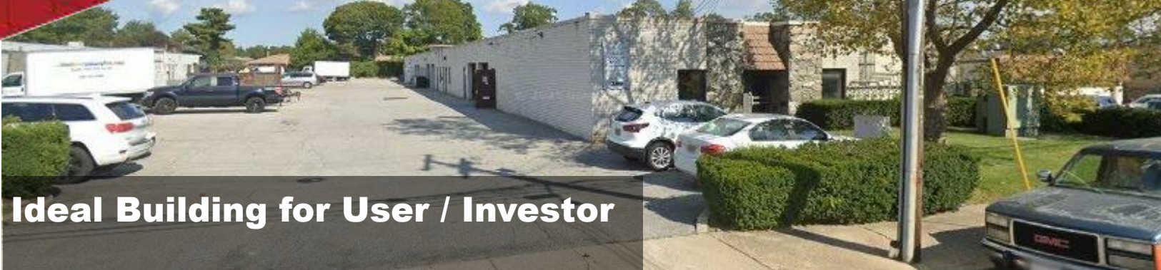
Ideal Building for User / Investor