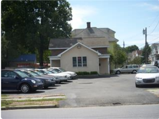
09/08/2011 - Photo 2011