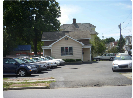
09/08/2011 - Photo 2011

SWIS 510800 Status Active Roll Section Taxable Property Class 431 - Auto dealer Ownership Code In Ag District No Zoning T5MS - T5 Main Street Neighborhood 8005 Midtown School District KINGSTON CONSOLIDA Property Description 335-337 Total Acreage/Size 55 x 100 Deed Book 7507 Deed Page 70 Grid East 630103 Grid North 1126810